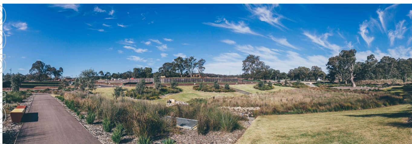
Glenlea Estate, Mt Barker

Mt Barker continues to be a long-term key focus for the Company, supported by market conditions of strong purchaser demand and revenue escalation. With no signs of slowing of purchaser demand, the Joint Venture decided there was merit in engaging two civil contractors onsite to expedite a pipeline of product to meet the demand. As such, during the year the Joint Venture engaged BMD Urban and South Coast Sand & Civil to complete construction of stages 2a, 3 and 4, as well as making significant inroads into the civil works for stages 1d and 5.