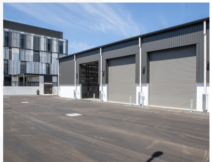
World Park 01, Keswick SA