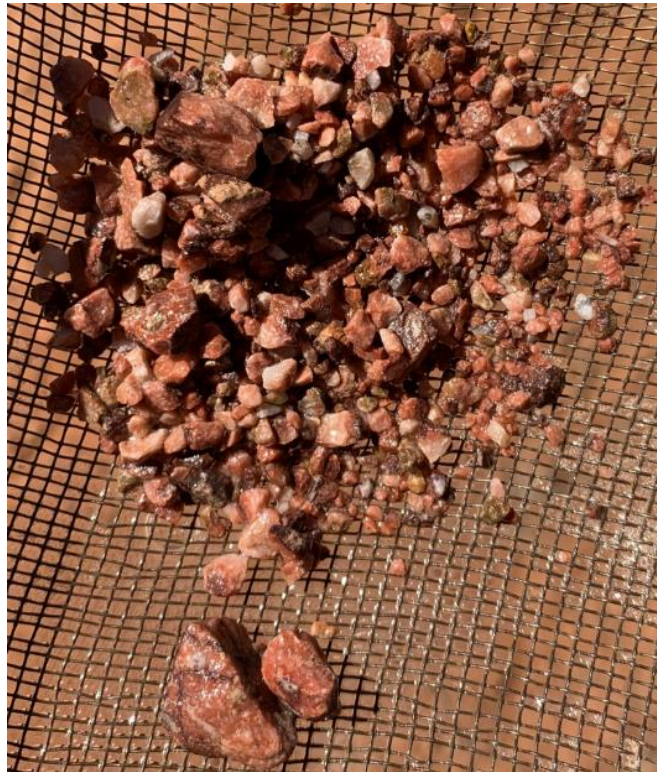
Figure 3: Hematite alteration at LURC001 at 255m

While all drill holes intersected the top of the modelled gravity anomaly, it currently remains inconclusive as to whether the source of the intense density feature has been adequately tested and explained.