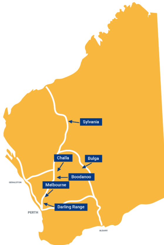
Figure 1: Project Locations

An overview of the location of the Company's projects is shown in Figure 1.