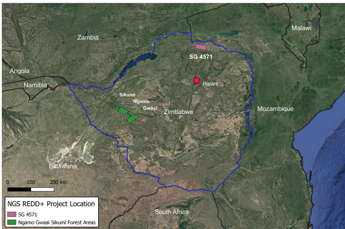
Figure 1 - Areas making up the Ngamo-Gwaai-Sikumi REDD+ Project

Invictus and FCZ will develop the NGS REDD+ project to protect the indigenous forests by implementing programs to mitigate deforestation activities. The resulting benefits of these programs are quantified in the form of emission reductions which then generate carbon credits.