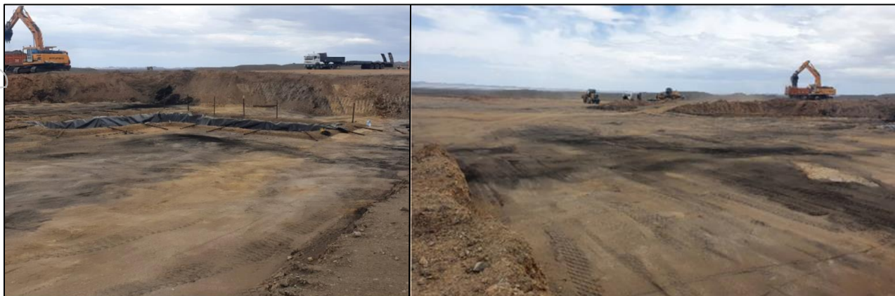
Pilot production pad under construction