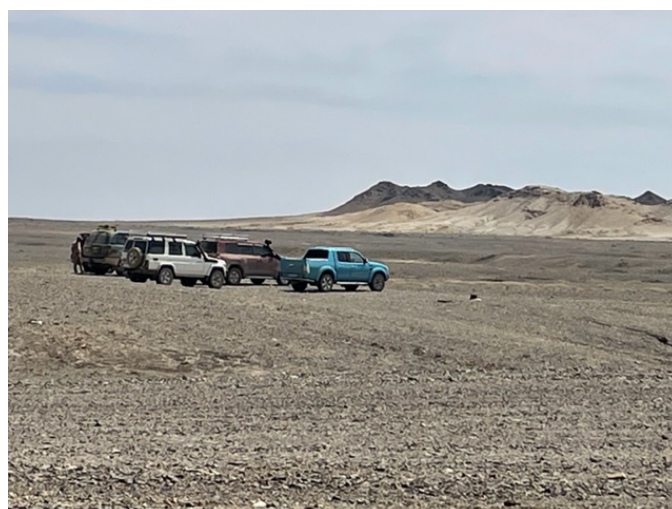
Elixir, Monbag and Major personnel survey the pilot production site

The Company's extended pilot production program is advancing in parallel to the exploration and appraisal drilling. Experienced Mongolian contractor Monbag LLC has been hired to construct the civil works and this will commence shortly. The spudding of the first of the two production wells by drilling sub-contractor Major Drilling is expected by around the end of August 2022.