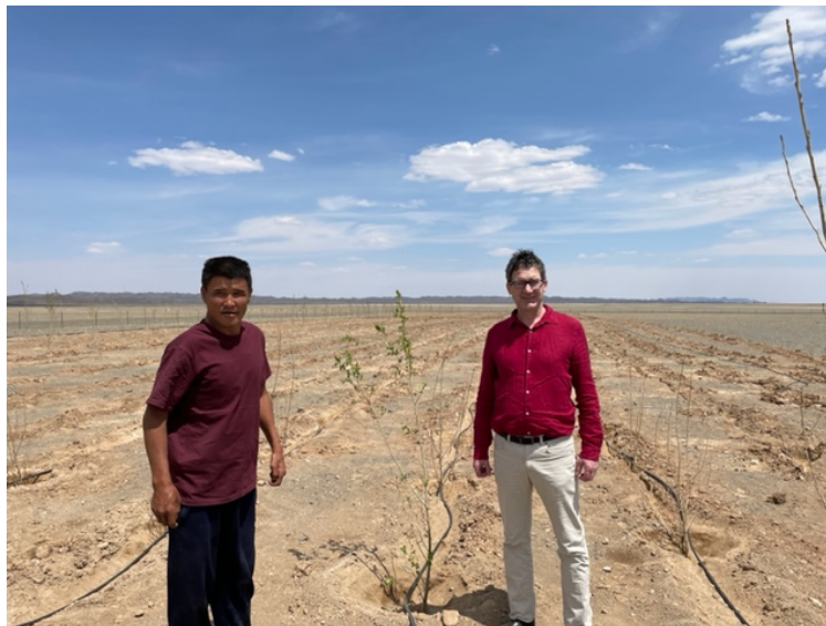
Elixir sponsored tree plantation in Nomgon

Managing community relations is a top priority for Elixir (as we believe it needs to be for any resources company). We recently opened a tree plantation in the small Gobi town of Nomgon. The Mongolian Government strongly supports tree planting efforts as part of a broad program to fight desertification, mitigate carbon emissions, etc.