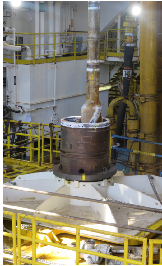
Downhole drilling assembly and installation within the well head housing on the mudmat