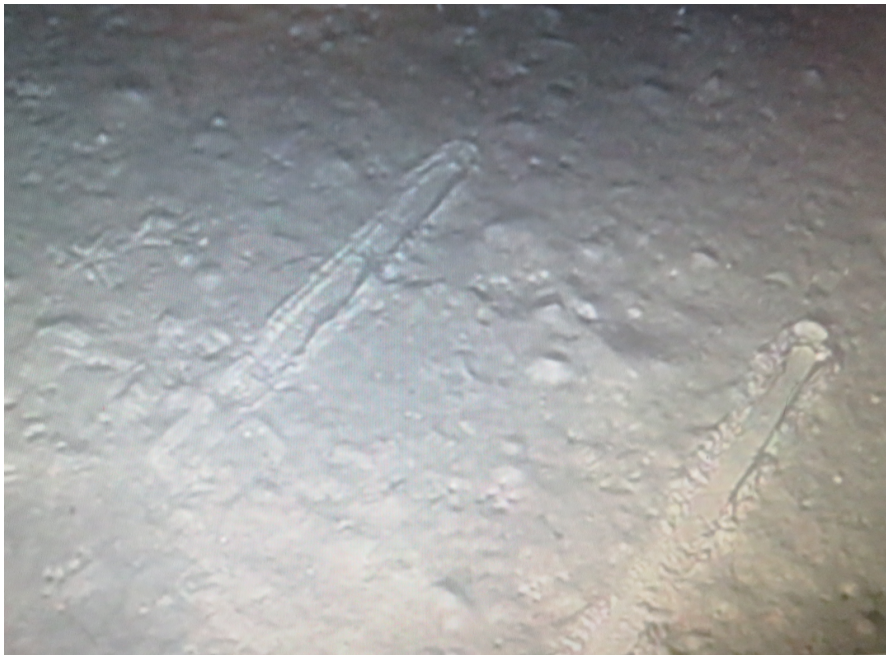
Drilling location marked on sea floor prior to spud by ROV.