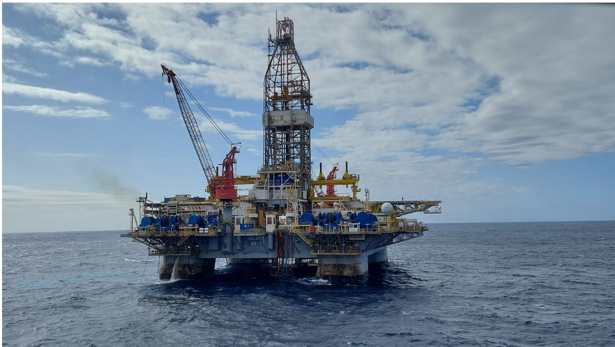
Valaris MS-1 on location for drilling of Sasanof-1