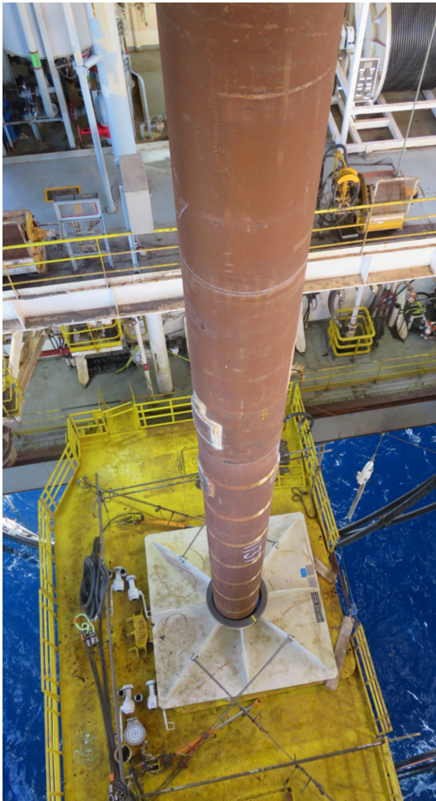
36" Conductor and mudmat being made up prior to deployment.