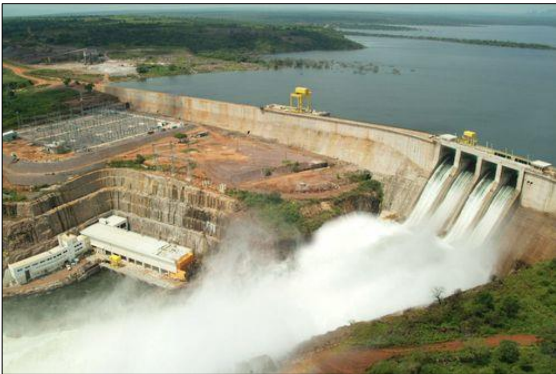
Figure 3 - Capunda Dam with hydroelectric plant and associated power infrastructure.

For Angolan agricultural industries, the current situation involves the importation of ammonia and/or fertilizer. Transportation and internal handling costs currently comprise ~45% of the cost of landed product in Angola. By developing a green ammonia facility close to end markets, there is a significant margin that can be captured whilst remaining competitive with alternative sources. Low-priced and abundant power supplies make locally produced green ammonia significantly more attractive than imported ammonia (Fig. 3).