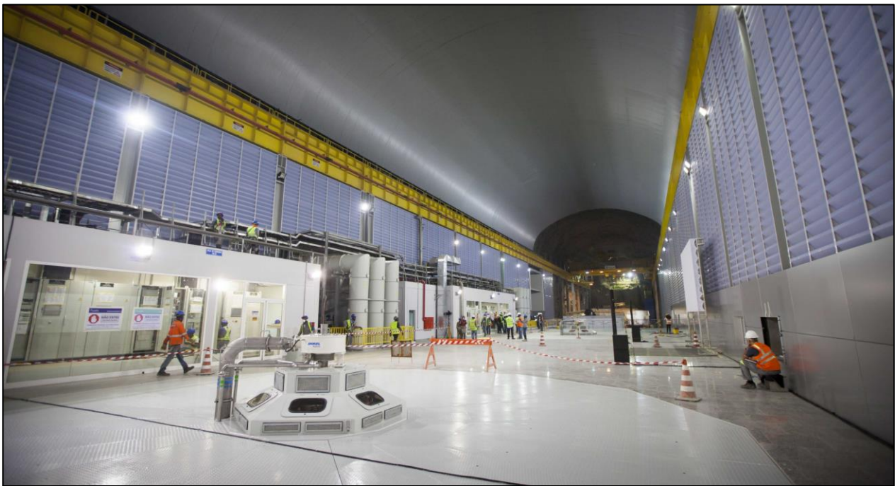
Figure 4 - Laúca Hydroelectric Plant. A 2GW run-of-the-river hydroelectric project located on the Kwanza River and currently the second biggest hydroelectric power facility in operation in Africa.

Large-scale hydroelectric projects completed recently include the Laúca hydroelectric power station, a 2GW run-of-the-river hydroelectric project located on the Kwanza River that is currently the second biggest hydroelectric power facility in operation in Africa (Fig. 4), the Caculo Cabaça Hydroelectric Project, the Balalunga Project and several others throughout the southern region of the country.