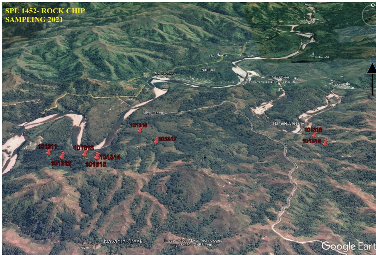
Plate 1 – Satellite image showing GPS locations of nine rock chip grab samples collected from outcrops on SPL1452 (Scale 1cm = approx. 100m)