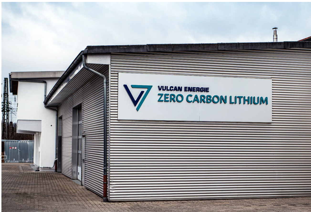
Vulcan's newly opened laboratory in Durlach-Karlsruhe

Importantly, the acquisition of new instruments including an ICP-OES and an IC, enhance the team's efficiency and reduces analysis waiting time. The brine can be fully characterised rapidly, and the team can gather information and react fast to support operation at the pilot plant.