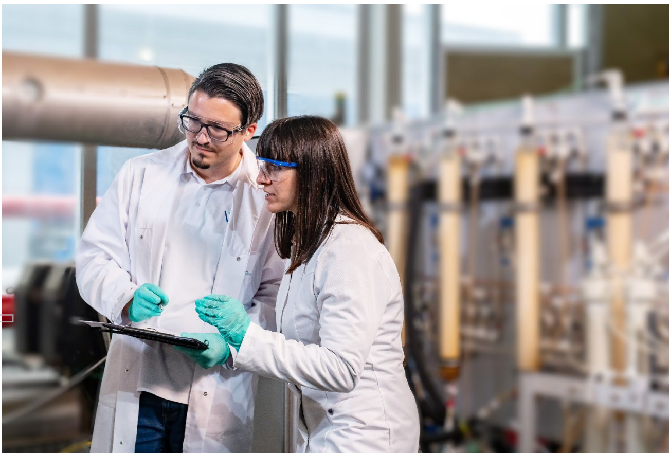
Vulcan's DLE Pilot Plant, successfully in operation for 12 months

This thorough test work produces crucial data needed for de-risking the lithium extraction process. Consistent lithium concentration and low level of impurities are being reported, together with lithium recovery rates averaging 94-95%, which are above the levels noted in the 2021 Pre-Feasibility Study.