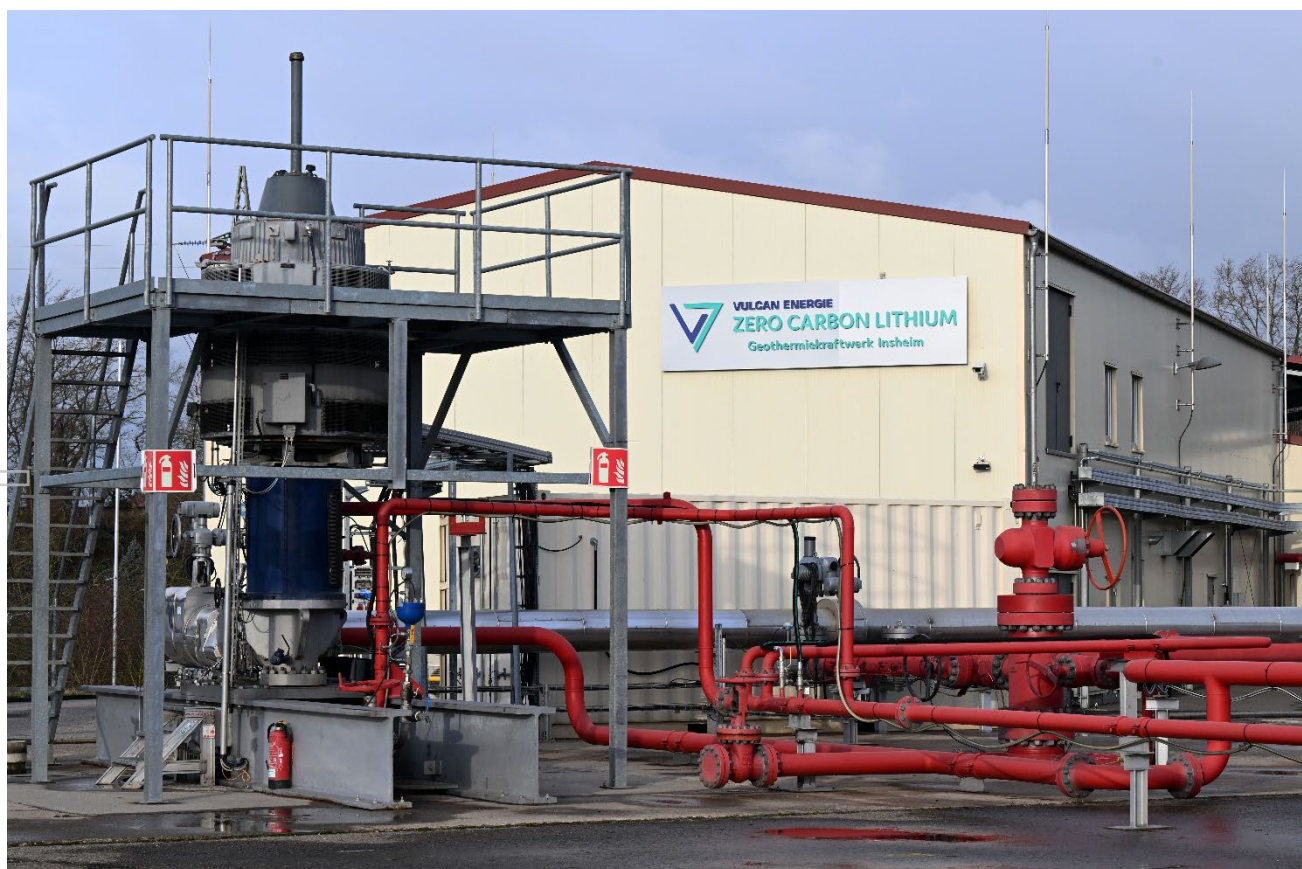
Vulcan's geothermal renewable energy plant, currently in commercial production

Vulcan acquired two electric drill rigs in November 2021 which can drill to the target depth required for geothermal energy wells in the Upper Rhine Valley, Germany. Refurbishment of the drill rigs has commenced to ensure optimal safety and efficiency during operation. Vulcan's two deep drilling rigs are a scarce, strategic asset for Vulcan, at a time when Germany is seeking to decarbonise its heating and deploy widespread deep geothermal development.