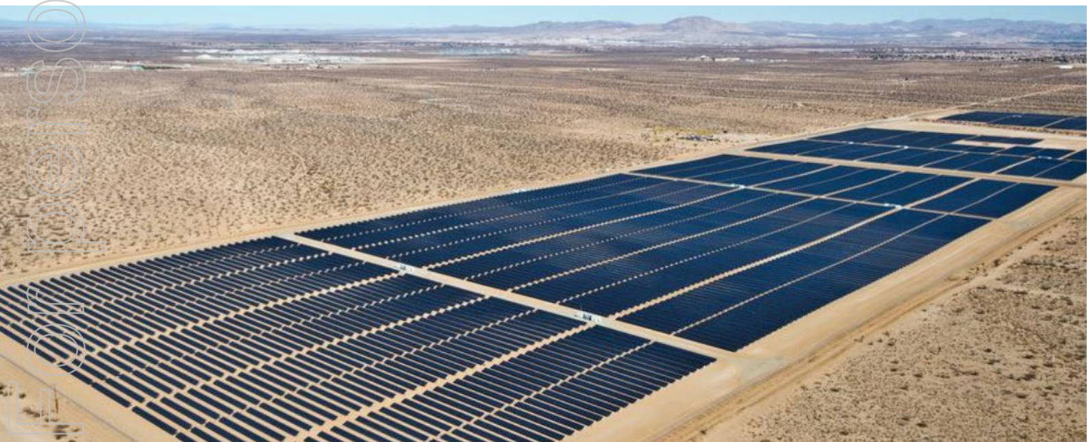
Figure 3 - Typical Large Scale Solar Array

For the HyEnergy™ Project, solar arrays to generate a peak power load from 2.4 GW of Tier 1 solar panels, mounting structures, inverters and transformers with DC and AC cabling.