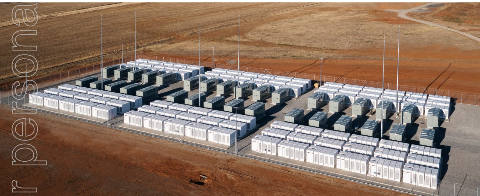
Figure 4 - South Australian Hornsdale Tesla Battery Installation