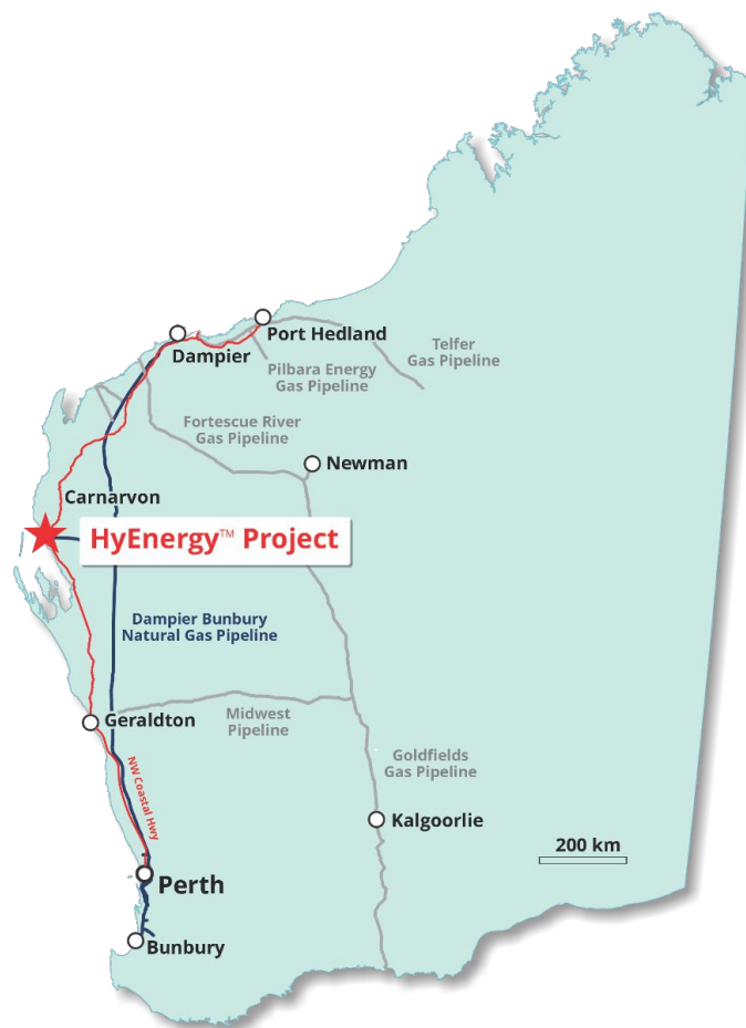
HyEnergy™ Location Plan

The renewable energy potential of the site is discussed further in – RESOURCE ASSESSMENT.