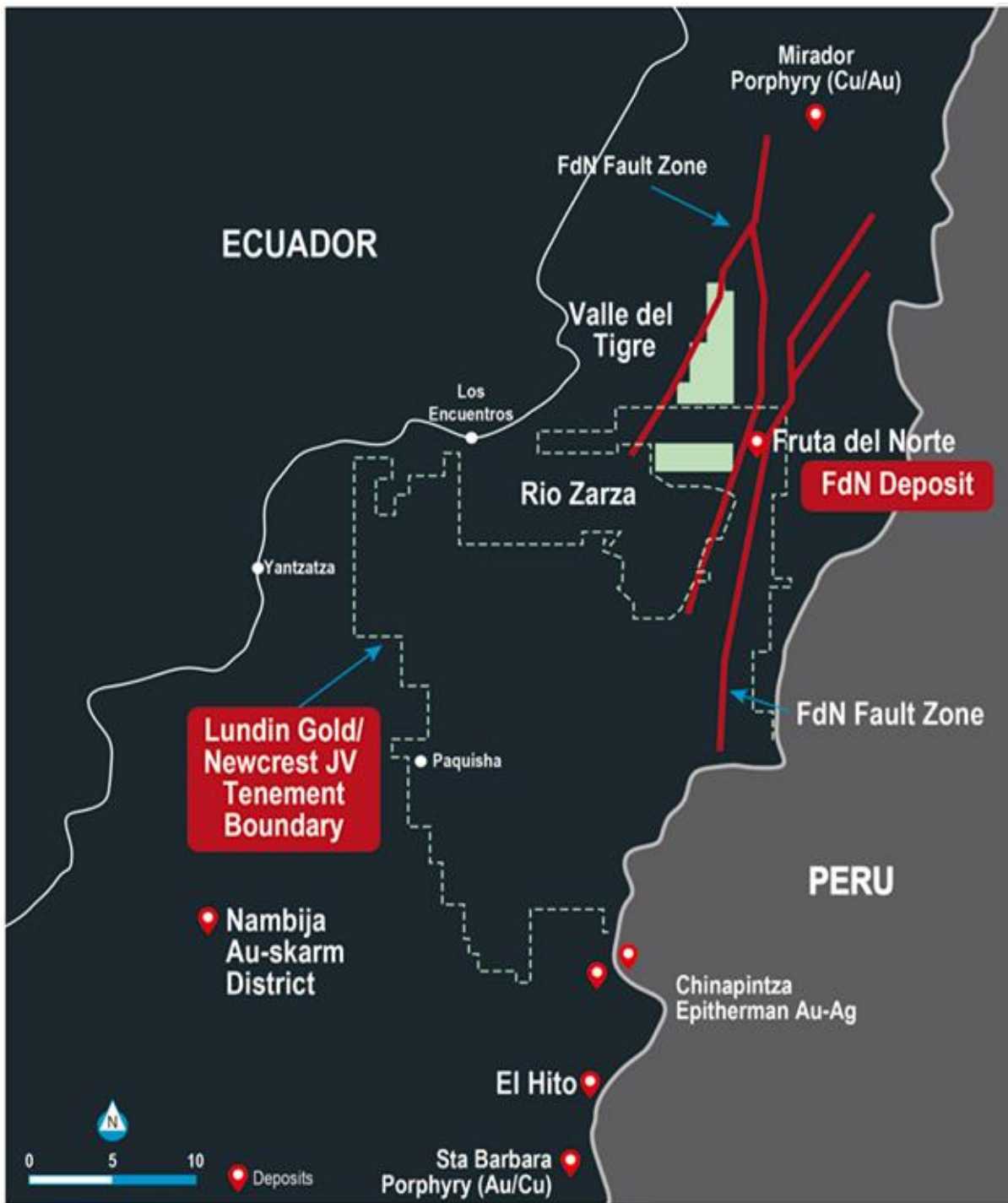
Figure 1 – Valle del Tigre & Rio Zarza Location