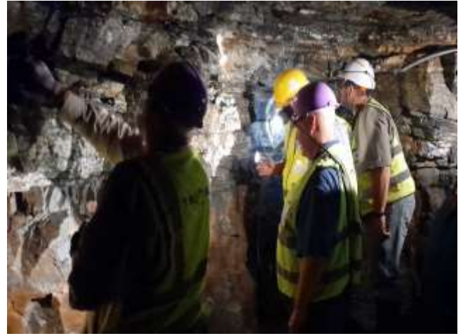
Figure 4 and 5 – Long holes drilled during the trial mining

Bulk emulsion explosives had been selected and supplied by Enaex Africa for trial mining due to the advantages of bulk emulsion explosives over alternative explosive technologies, both in terms of safety and blast performance. The desired outcome of advance per hole and reef contact breaking points was achieved. All blasted holes were primed up to 150 grams Trojan cast booster and the detonator inserted to the middle of the shot hole. The shot holes were pumped with Devex explosives and tamped with stemming material top and bottom to ensure proper breaking can be achieved. This was done up to the collar of the hole. This process proved that 85% of all blasted rock will be cast to the cleaning drive.