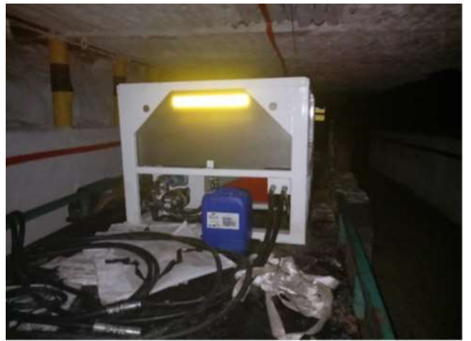
Figure 6 & 7- Bulk emulsion explosives charging unit

Evaluation of the blast fragmentation indicated that the burden and spacing should be increased and hole diameter reduced in future drill designs to increase the rock fragmentation size. The drilling redesign will lead to a cost reduction in both drilling and explosive costs. Figure 6, indicates the blasted stope face, broken rock casted into the cleaning drive, and rock fragmentation.