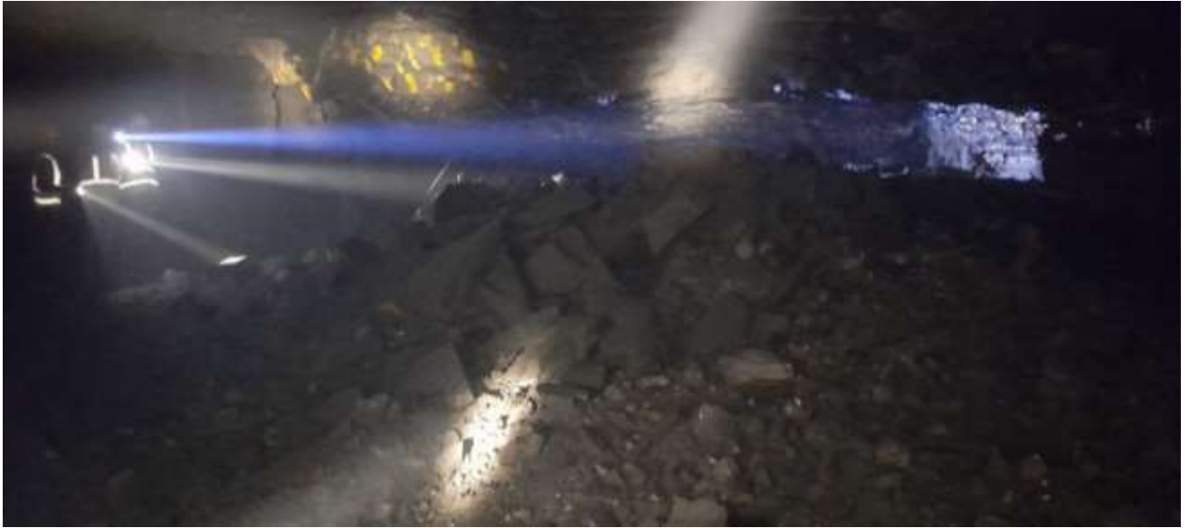
Figure 8 – Blasted stope face, casted broken rock and rock fragmentation

The trial mining at Frankfort Mine was a success and proved that the planned mechanical longhole drilling applied to a narrow vein orebody will achieve the desired outcome and open endless possibilities within these goldfields.