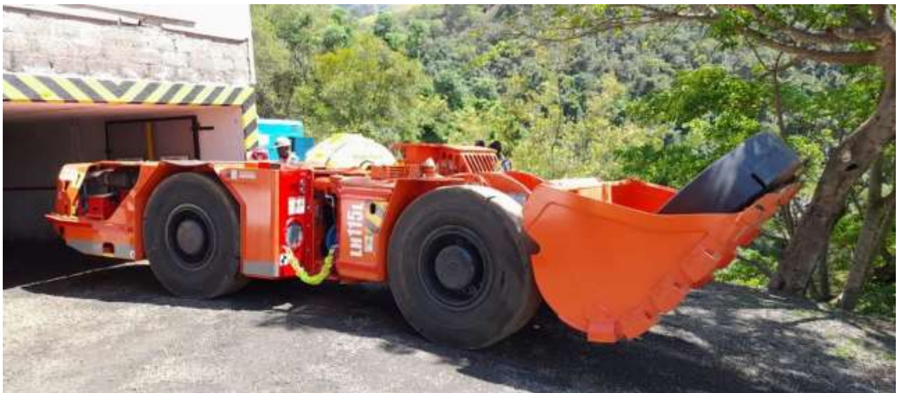
Figure 1: LHD at Frankfort Mine for Trail Mining

Theta Gold Mines Limited (“Theta Gold” or “Company”) (ASX: TGM, TGMO | OTCQB: TGMGF) is pleased to announce Trial Mining at Frankfort is now complete. The Beta, Frankfort, and CDM mines, all of which form part of the Central Northern Area are collectively referred to as TGME Underground (UG) Project. Trial Mining was completed to demonstrate that the mechanized long hole stoping mining method was suitable to mine the narrow gold reef system (0.60-6.0m) and to inform the Definitive Feasibility Study (“DFS”) for the TGME Underground Project currently in progress.