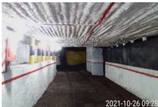
Figure 2 & 3 – Support installation before and after at Frankfort Mine

A total of 34 horizontal blast holes were drilled at various lengths across the span of the trial mining block. A series of holes were drilled on a staggered pattern spaced 60cm apart thereafter converting to a single horizontal line of drill holes spaced 60cm apart to complete the remainder of the holes. Different drill hole diameters were tested ranging from 45mm to 52mm. Three different drill bits