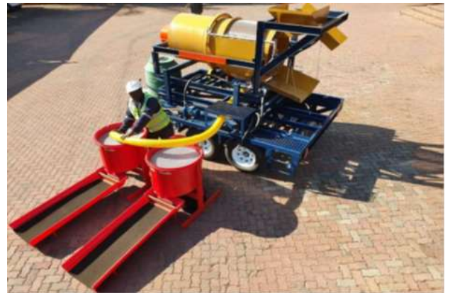
Figure 9 & 10 – GoldKach MkIV Concentrator

This announcement was authorised for release by Theta Gold Mines Board.