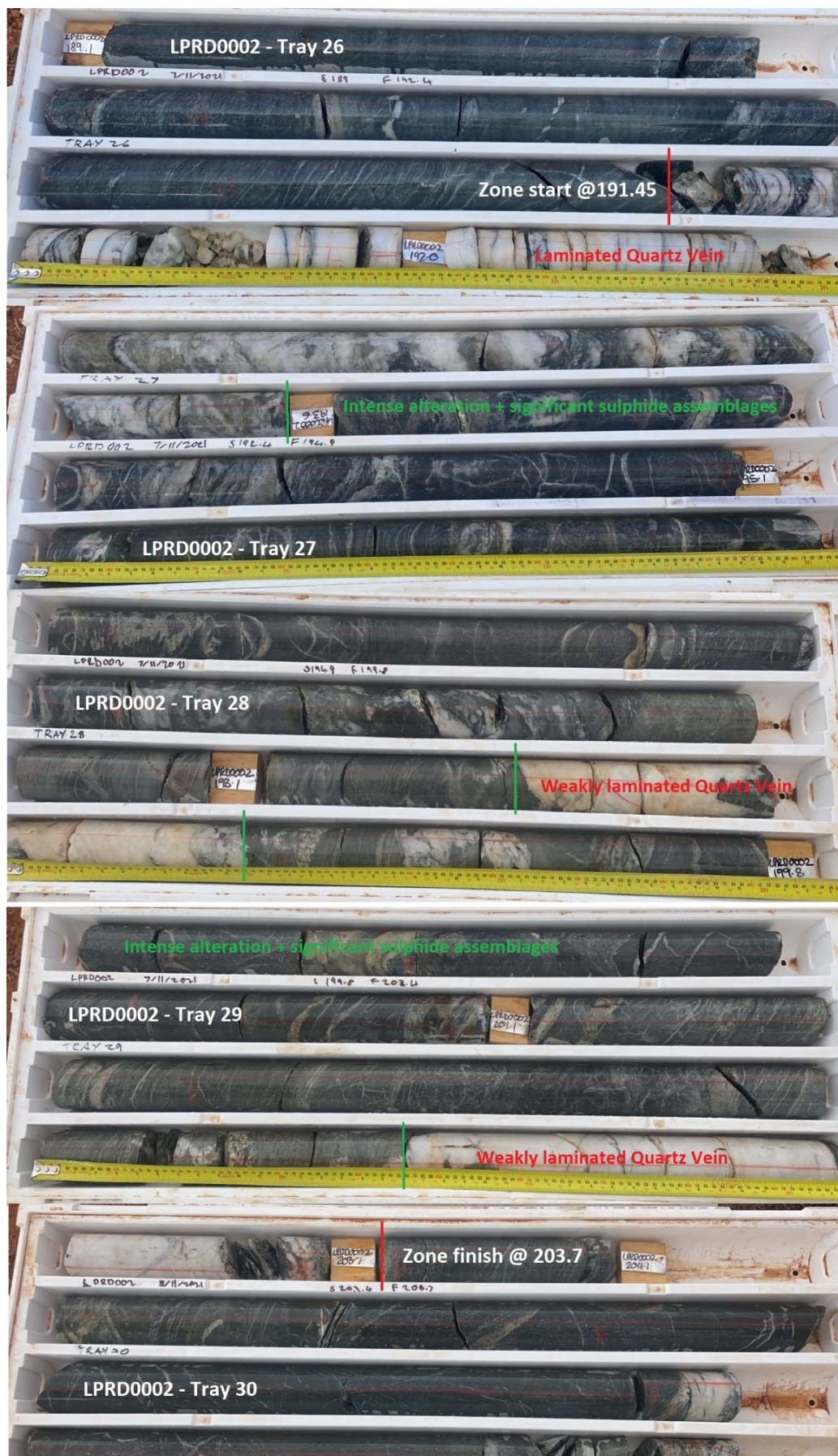
Figure 3 – Leipold Prospect Core Photos.