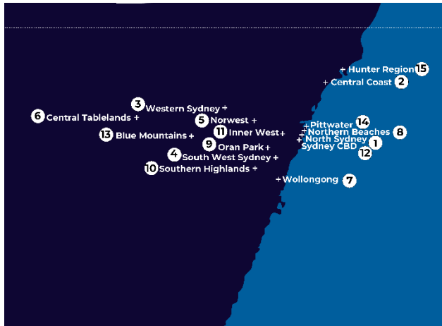
NSW Existing Locations: 15