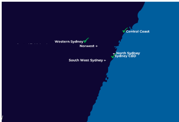
NSW Target Tuck-in Locations: 6 (completed: 3)