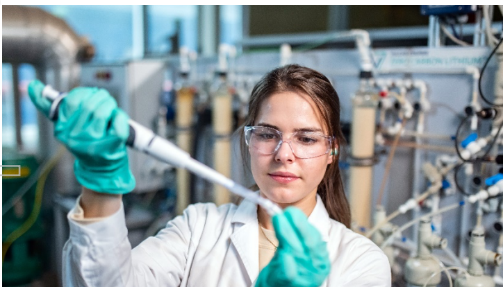
Figure 2: Ongoing work at Vulcan's in-house designed and operated Pilot Plant 1

Pre-treatment and post-treatment of the brine has also been demonstrated successfully, the former to enhance sorbent life and performance, and the latter to return the brine to materially the same state prior to re-injection. Whilst assuming pre and post treatment in its PFS and now DFS as a base case,