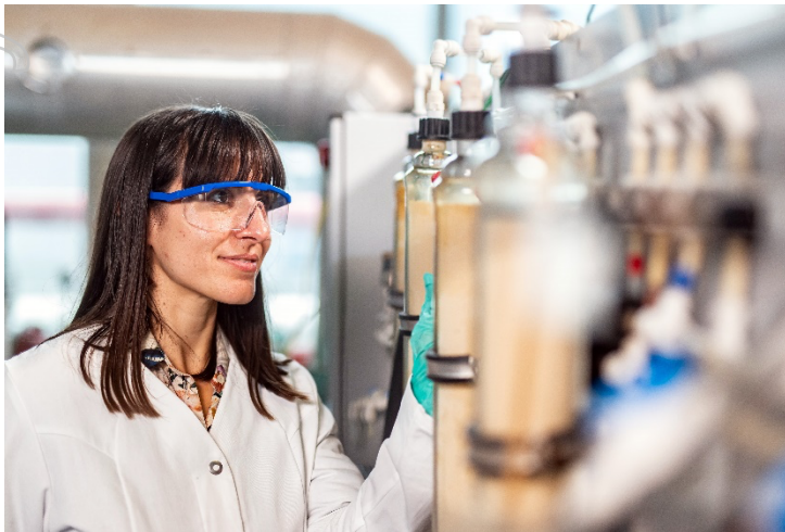
Figure 1: Ongoing work by Vulcan's chemistry and chemical engineering teams

successfully demonstrate multi-cycle sorption tests on Upper Rhine Valley geothermal brine using multiple commercially available aluminate-based sorbents 2 , providing commercial optionality for Vulcan. All sorbents have demonstrated >90% lithium recovery, in line with the assumptions used in the PFS, and consistent with commercial DLE development projects internationally.