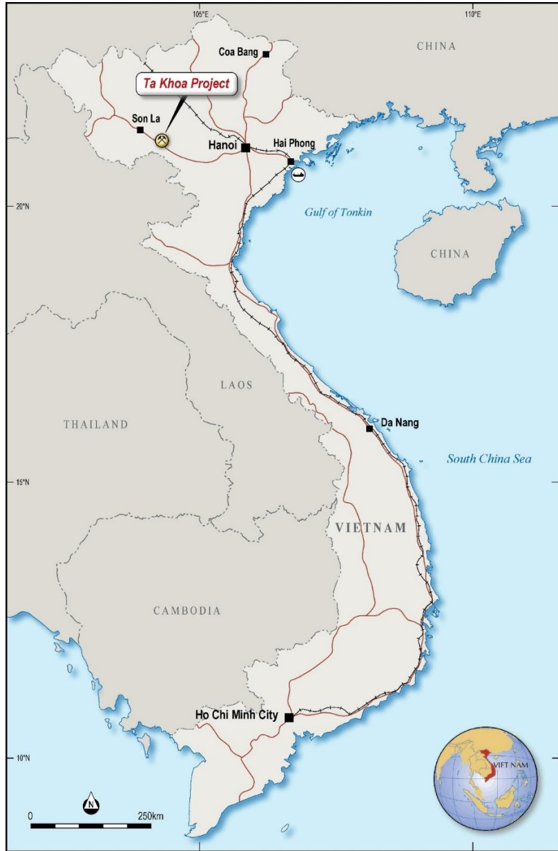
Figure 2. Ta Khoa Nickel-Cu-PGE Project Location

By combining the Company's existing mineral inventory (Ban Phuc Disseminated Sulfide - DSS), exploration potential presented by high priority targets such as Ban Chang, King Snake, Ta Cuong and Ban Khoa, and the ability to source third party concentrate, Blackstone will be able to increase the scale of its downstream business to cater to the rising demand for downstream nickel products.