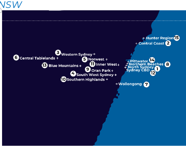
NSW Existing Locations: 15