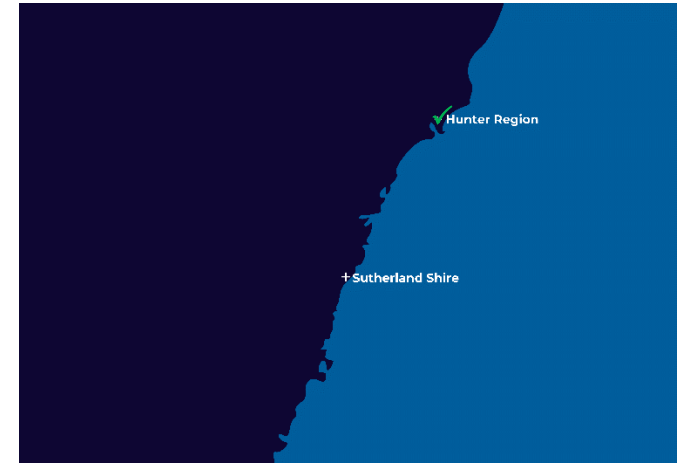
NSW Target Marquee Locations: 2 (completed: 1)