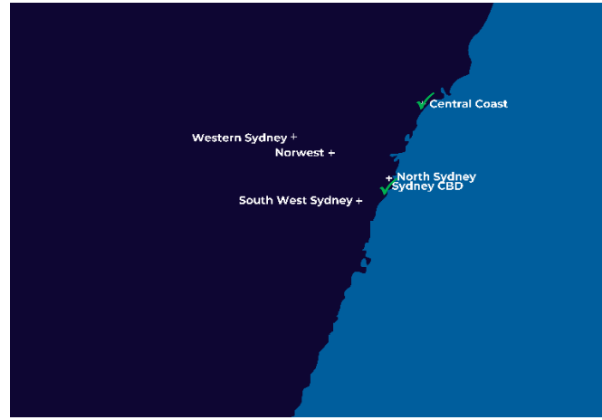
NSW Target Tuck-in Locations: 6 (completed: 2)