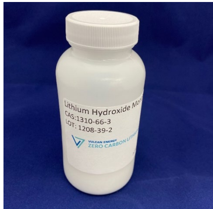
Images of lithium hydroxide monohydrate from the Zero Carbon Lithium™ Project.