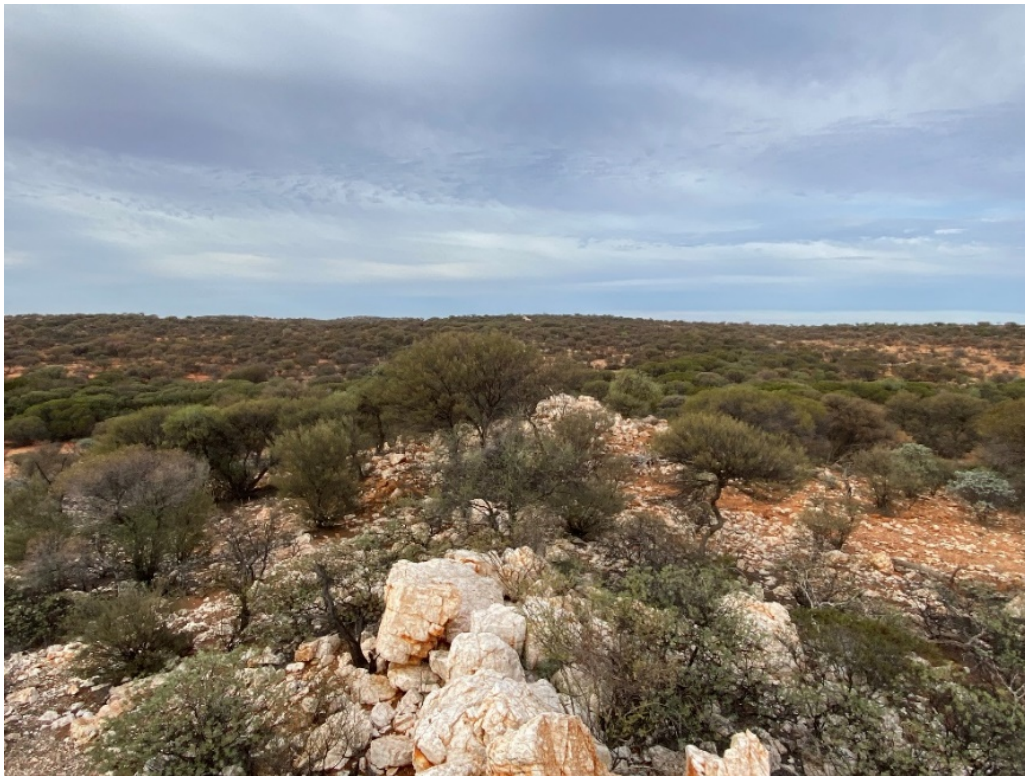
Image 1: Photo showing landscape and the Ballard Fault at Ida Valley Gold Project.

TechGen Metals Limited (ACN 624 721 035) (" TechGen " or the " Company ") is pleased to inform the market that a large soil sampling program has commenced at the Company's 100% owned Ida Valley Gold Project located 80km northwest of Leonora in the Yilgarn Craton of Western Australia (Image 1 & Figure 1). The Ida Valley Gold Project has up to 30km of prospective strike extent and consists of three Exploration Licences covering a combined area of 199km 2 . The project is ideally located in between the Lawler's and Mount Ida Mining Districts.