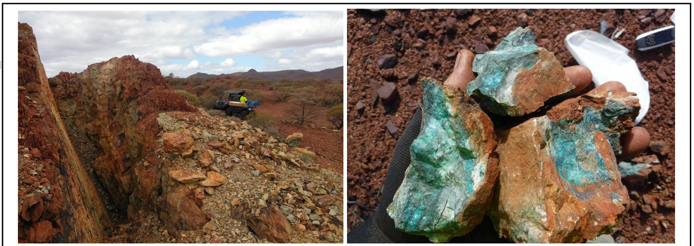
Photo 1 & 2: Unrecorded workings with malachite and malachite-rich rocks from outcrops within project area.

The VTEM™ Max survey at the Station Creek Project will consist of approximately 300 line kilometres of surveying with nominal 200m spacing between flight lines. The survey is being flown by UTS Geophysics Pty Ltd and the data, once received, is to be processed and modelled by Russell Mortimer at Southern Geoscience Consultants (SGC). The airborne survey will cover the entire project area.