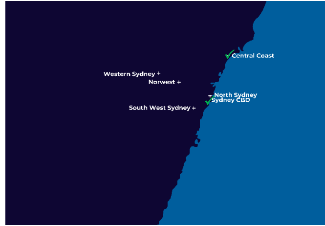
NSW Target Tuck-in Locations: 6 (completed: 4)