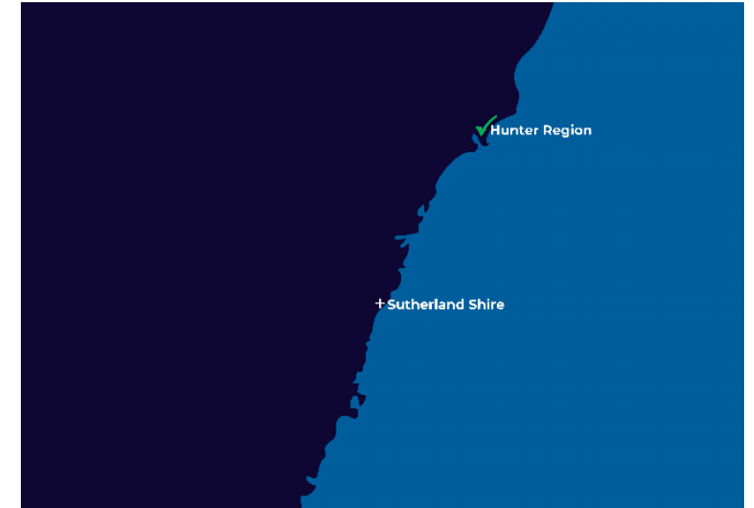
NSW Target Marquee Locations: 2 (completed: 1)