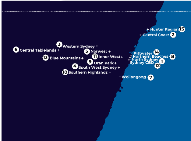
NSW Existing Locations: 15