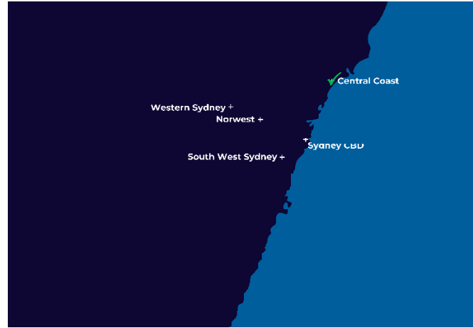
NSW Target Tuck-in Locations: 5