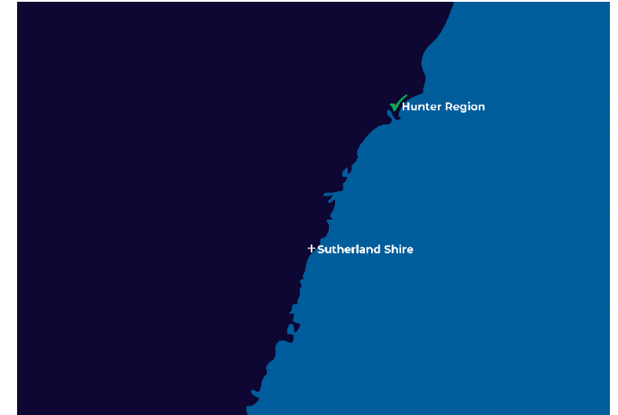
NSW Target Marquee Locations: 2