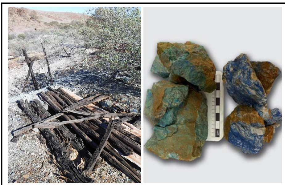
Figure 2: One of several historic copper workings from the 1960s in the project with oxide copper samples.

"The Company's Blue Rock Valley Project is an under explored and highly prospective mineral province, with the potential for high grade discoveries. This region has historic copper-lead-zinc & copper working with rock chip samples to 16% Cu adjacent to the Talga shear zone. We are pleased that the survey has located late time bedrock conductors, especially combined with other influencing factors like geological control or geochemistry. We are looking forward to progressing these anomalies with ground EM surveys in the near future while we patiently await the return of the VTEM system to test our other highly desirable copper assets at Station Creek and Mt Boggola in four to five weeks".