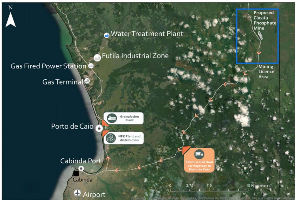
Figure 1 – Angolan exclave of Cabinda, with the C acata Phosphate Deposit and supporting infrastructure including 50km sealed roads to the planned granulation plant.

The Company is now positioned to develop Angola's first locally mined and manufactured fertilizer for sale into one of the most prospective growing regions globally." – Minbos CEO Lindsay Reed