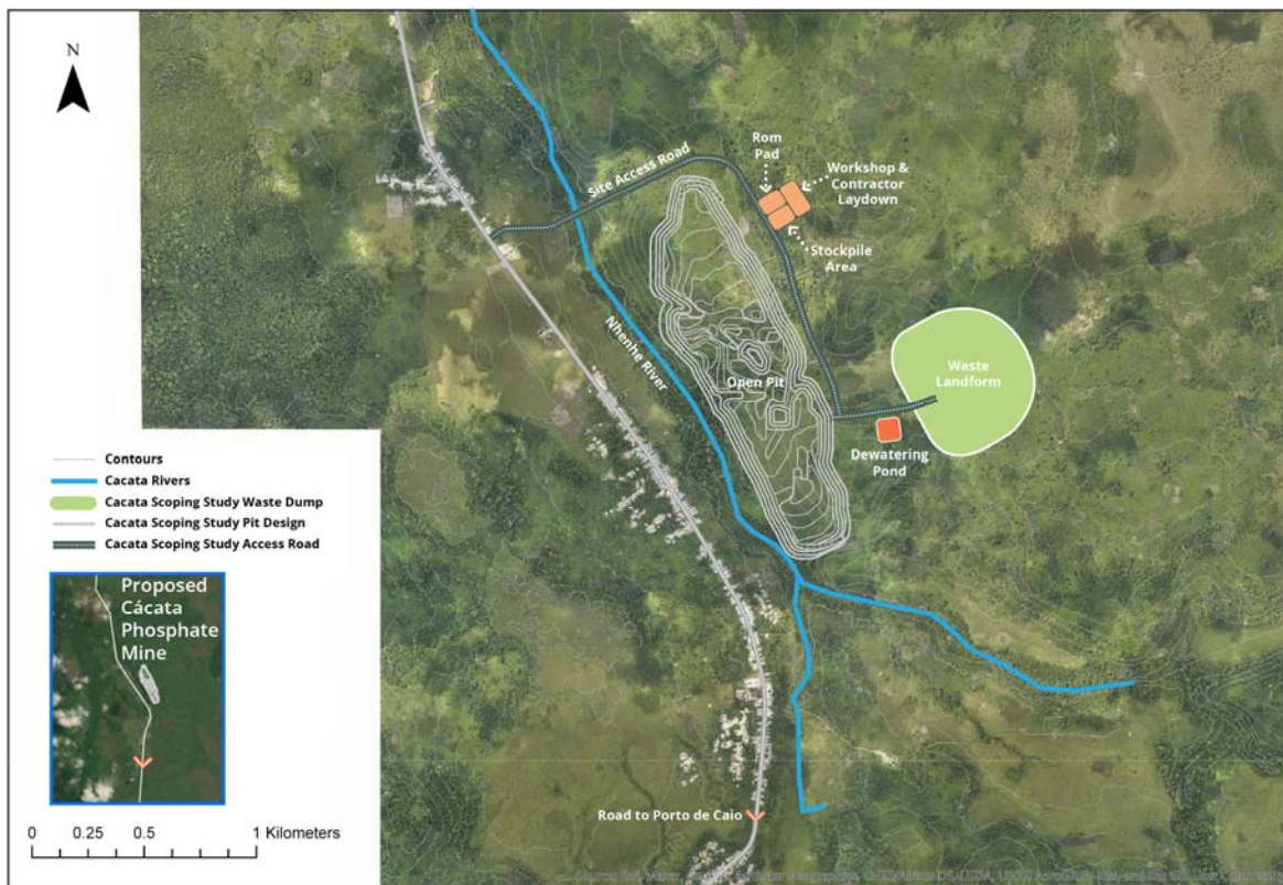
Figure 2 - Cácata Phosphate Deposit with planned pit shell, waste landform, and stockpile area proximal to dual lane highway, local village, and water source.

The Cácata deposit is a uniquely low-impact mining project, with a relatively small environmental footprint (Figure 2) and long operational life. The Cabinda Phosphate Project's planned small open-pit operation at the Cácata deposit measures less than 2km in length with the mining amenities positioned around the pit and close to a local workforce. The mine will also be located right next to the sealed dual carriage highway which is 50km from the proposed granulation plant at Port de Caio.