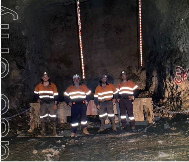
Figure 2: Development breakthrough into FAR #3

This critical development task was completed safely, in-line with budget and ahead of schedule. Barmenco will now focus on advancing the incline from the 1401 level and decline from the 1361 level, opening up additional working levels at Savannah North. These works are planned to be funded from existing cash reserves with the objective of being in a position to restart production operations from mid-2021.