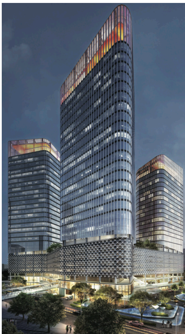
Figure 1: Artist Impression – Phnom Penh City Centre Project

The Company is pleased with the continued pace of development during the COVID-19 pandemic and anticipates the completion date of the PPCC will be extended from second quarter of 2022 to fourth quarter of 2022 due to delays in 2020 associated with COVID-19 pandemic.