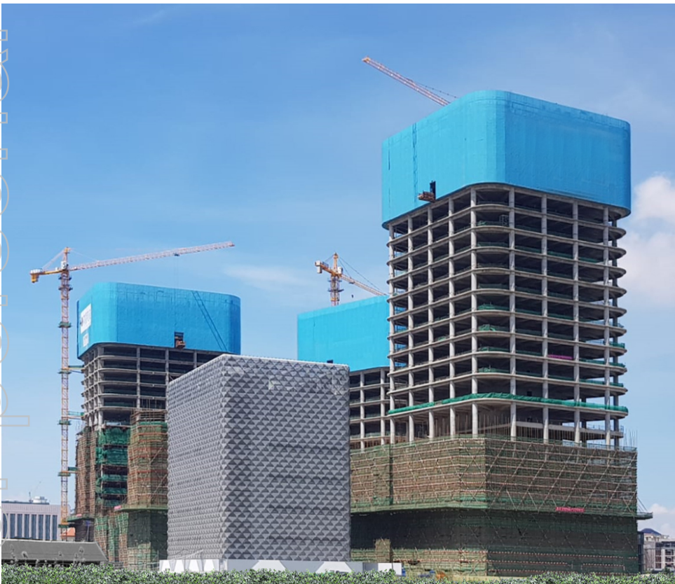
Figure 9: View of Global IT Media Hub Data Centre

The Company completed construction of the Global IT Media Hub Data Centre (“ITMH”) in late 2019 and is engaging with industry stakeholders to ensure ITMH enters operation in 2020. The Company believes the ITMH will greatly assist and foster the growth of Cambodia’s IT and technology industry.