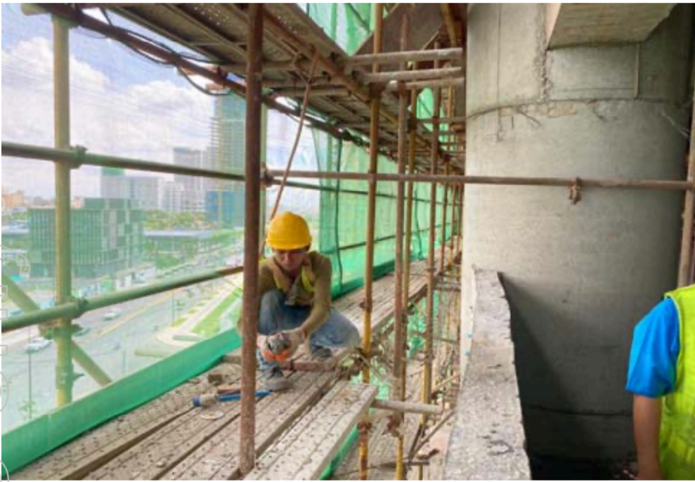
Figure 4: Zone 3 - Level 5