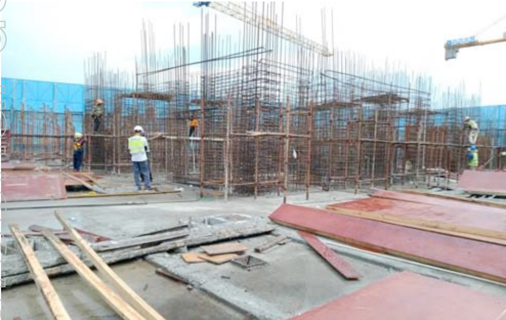
Figure 5: Installation Rebar and Formwork to Core Wall - Zone 3 - Level 21