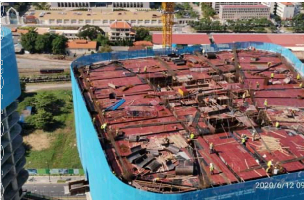
Figure 7: North View, Zone 2 - Level 19