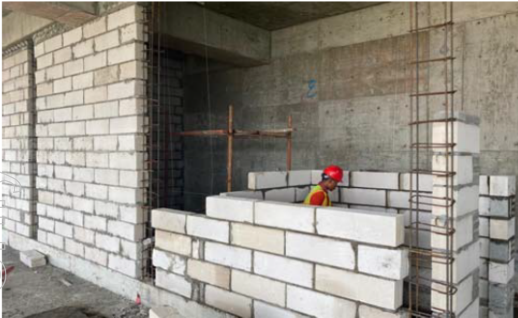
Figure 6: Activities Laying Block Wall - Zone 2 - Level 12