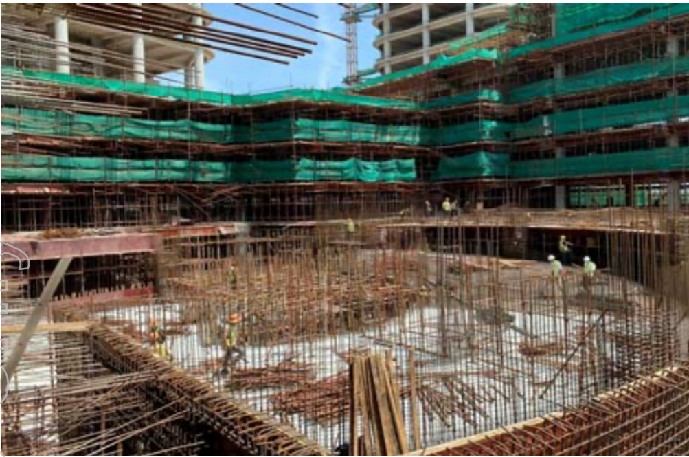
Figure 8: West view Zone 8 - Level 4