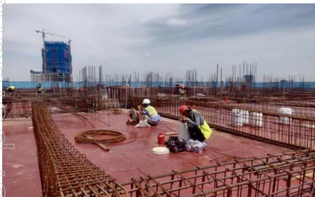
Figure 3: Zone 2 - Level 19 + Zone 3 - Level 22