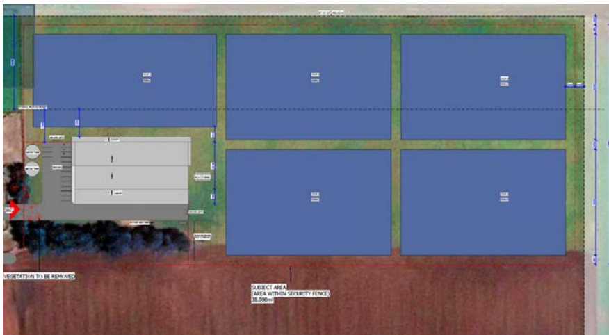
Figure 1: architects aerial view of stage 1

“We believe the power prices and cost of labour in Australia are in many cases restrictive to the business case of growing indoor long term, so we are adopting a practical approach whereby we are applying our skills in growing cannabis with a vision of where the industry is headed and how the industry is already evolving overseas.”