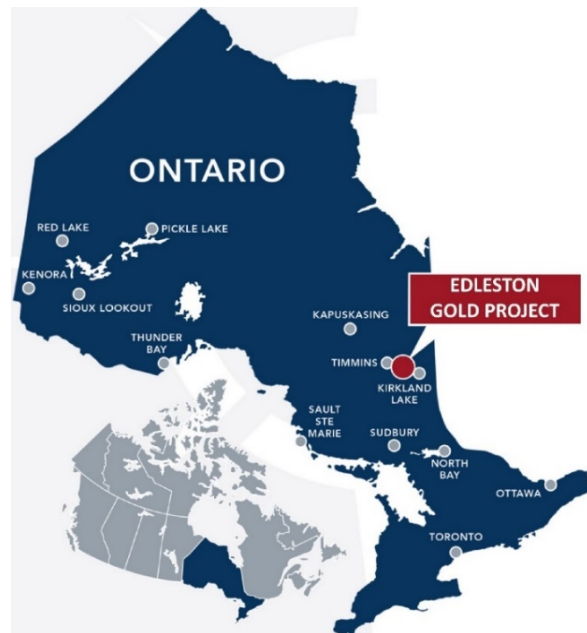
FIGURE 3: REGIONAL LOCATION PLAN OF ONTARIO

Further updates will be provided to market upon completion of this targeting program inclusive of a timeline of activities.”