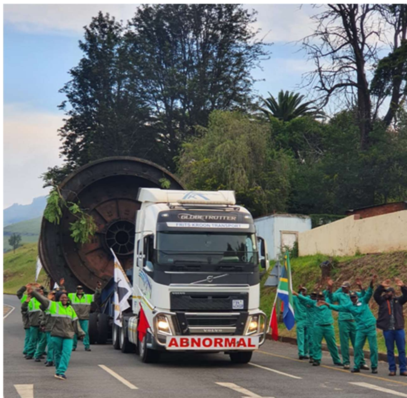
Figure 1: 2.5MW Ball Mill drum arriving at Pilgrim's Rest