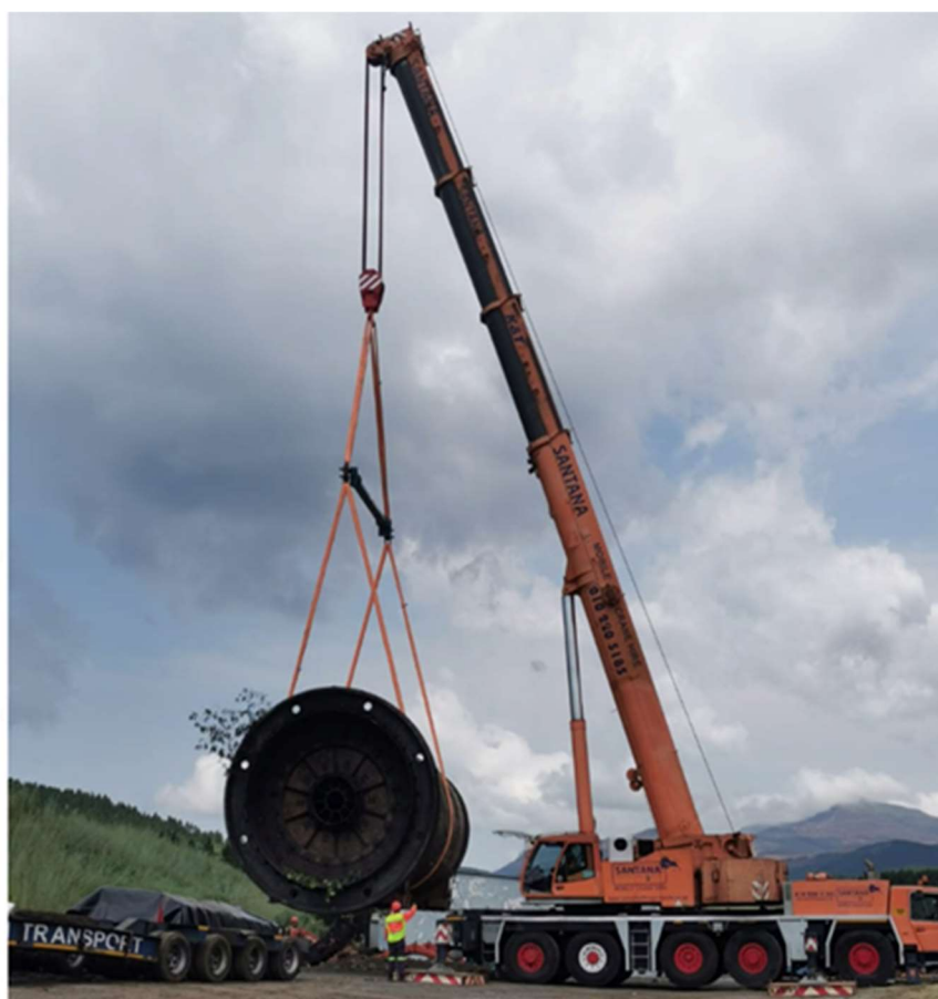
Figure 2: Ball Mill drum being offloaded upon arrival at Theta Gold's TGME CIL Plant site