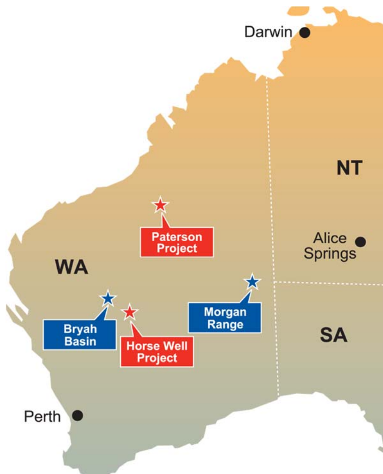
Figure 1 Regional location of Projects following acquisition of Dingo Resources