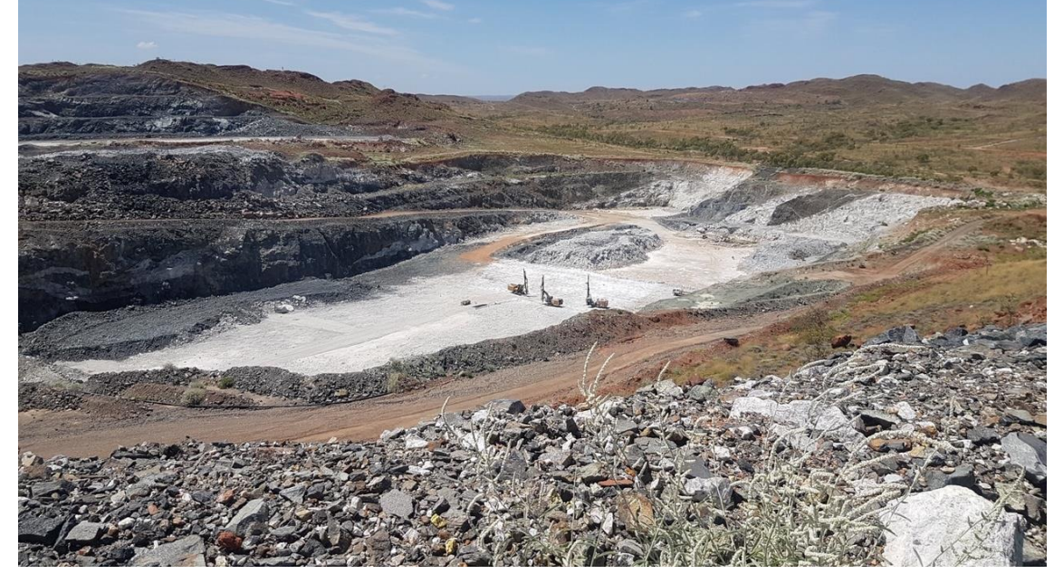
Central Pit – Drill and Blast March 2020

The processing plant has continued to achieve improved lithia recoveries with the current campaign delivering an increased average lithia recovery of 72% to 23<sup>rd</sup> March<sup>*</sup>, inclusive of the plant start-up. Several days within the current campaign (commencing 18<sup>th</sup> March) have delivered recoveries in the range of 74-76% and the Company's view is that the plant's recovery performance is now largely in line with its design criteria (being 72% to 78% lithia recovery, depending on the ore feed.