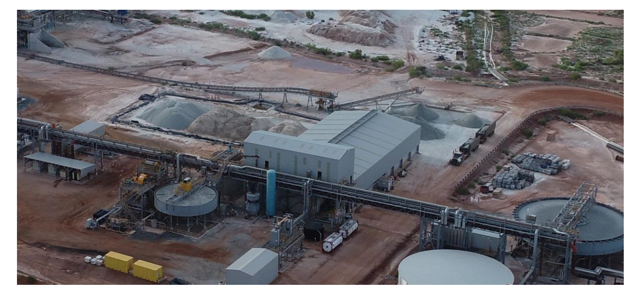
Final Product Shed and Stockyards, March 2020

*Quoted lithia recoveries are interim results and subject to final survey reconciliation.