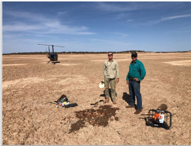
Figure 2: Sampling activities over Lake Throssell (LHS)