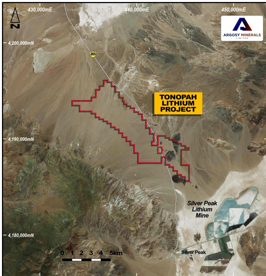
Argosy Minerals Limited – Tonopah Lithium Project Location Map (relative to Silver Peak Lithium Mine)

The Project has the following key characteristics: