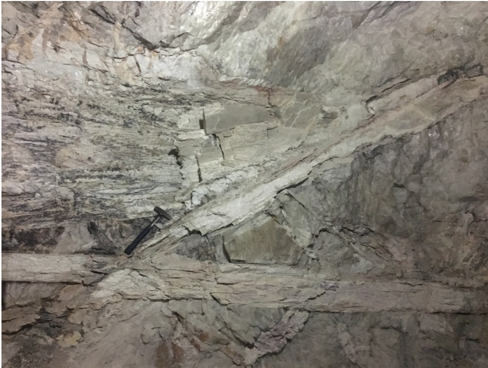
Figure 4 - Large spodumene crystals at Coronel Muerta Mine, Minas Gerais