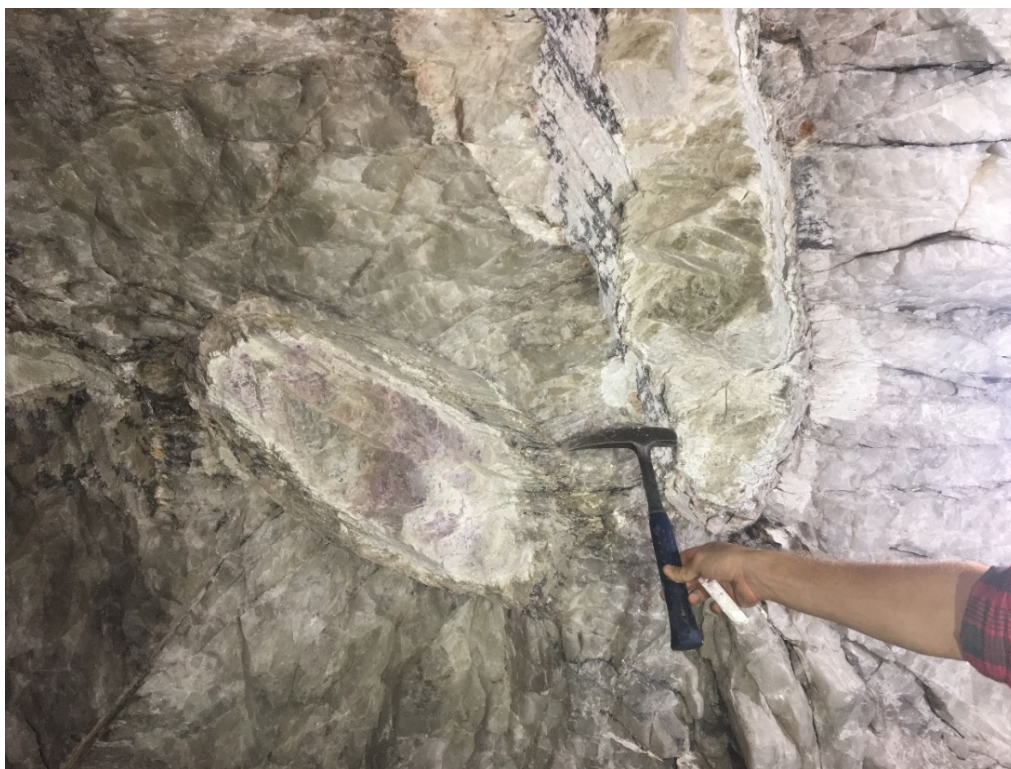
Figure 5 - Spodumene and Kunzite at Coronel Muerta Mine, Minas Gerais.