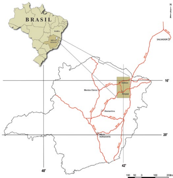
Figure 2 – Location Map – Minas Gerais State, Brazil. Highlighted Work Area

Sigma Lithium are the most active explorers in the region and are currently drilling out a world-class lithium resource base and reported at 45.7Mt @1.38% Li 2 O. Sigma is focused on 10 high-grade hard-rock lithium pegmatites, nine of which were past-producing lithium mines, yet have reported over 200 pegmatites within their tenure.