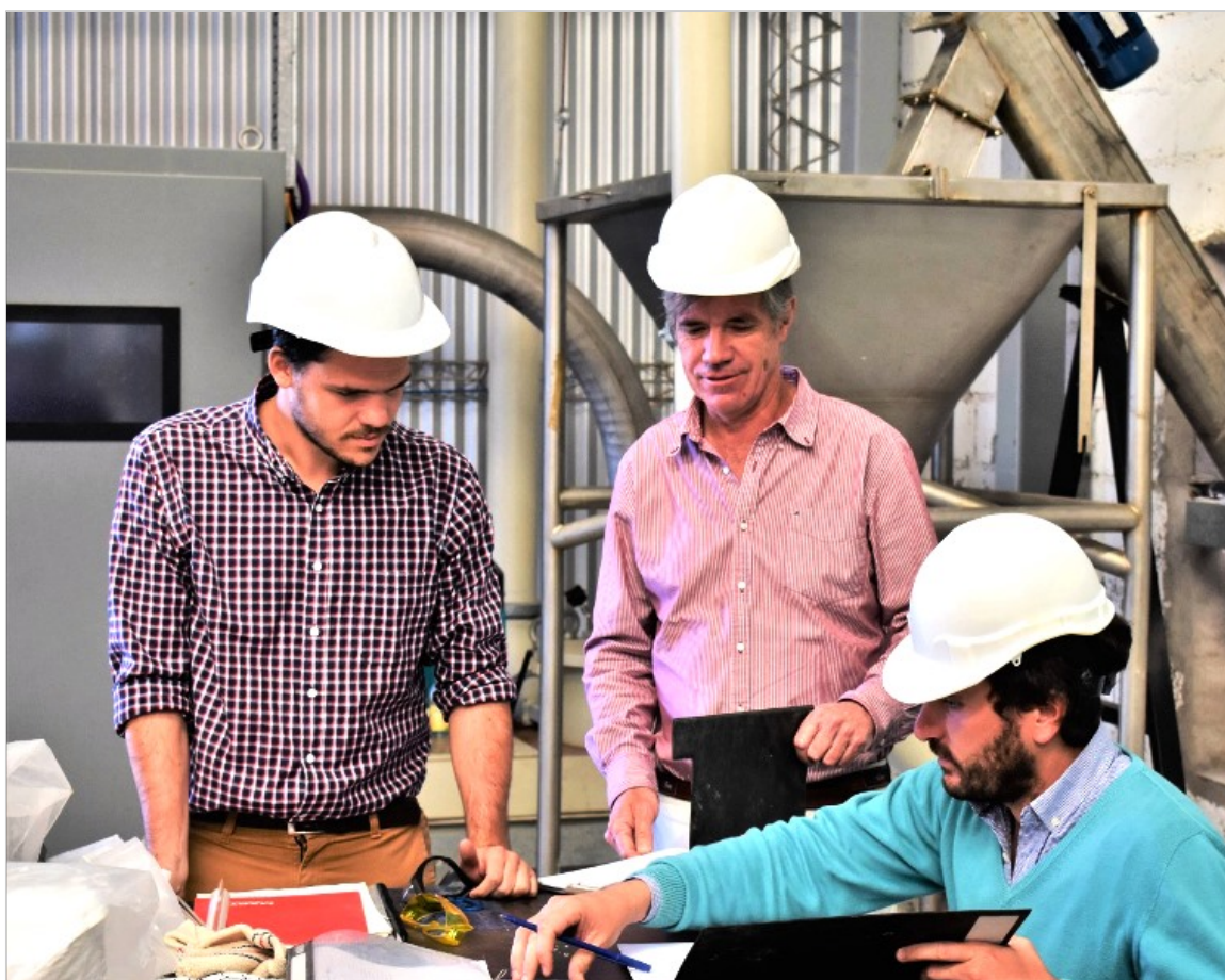
Figure 3. Rincon Lithium Project – Project Development Planning Works

Furthermore, Company executives in Salta discussed with Salta Province Mines Department regulatory officials the prospect of advancing the Project direct to 10,000tpa scale development and the associated approvals and permitting requirements. Noting this, the Company is conducting works to prepare the necessary applications for the full commercial scale project development approvals/permits for a 10,000tpa operation.