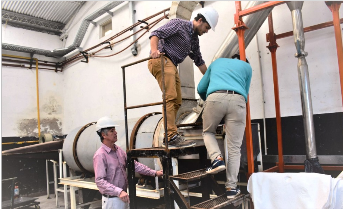
Figure 1. Rincon Lithium Project – Preparation for Continuous Pilot Plant Processing Works

A brief summary of works conducted during the Quarter is noted below.