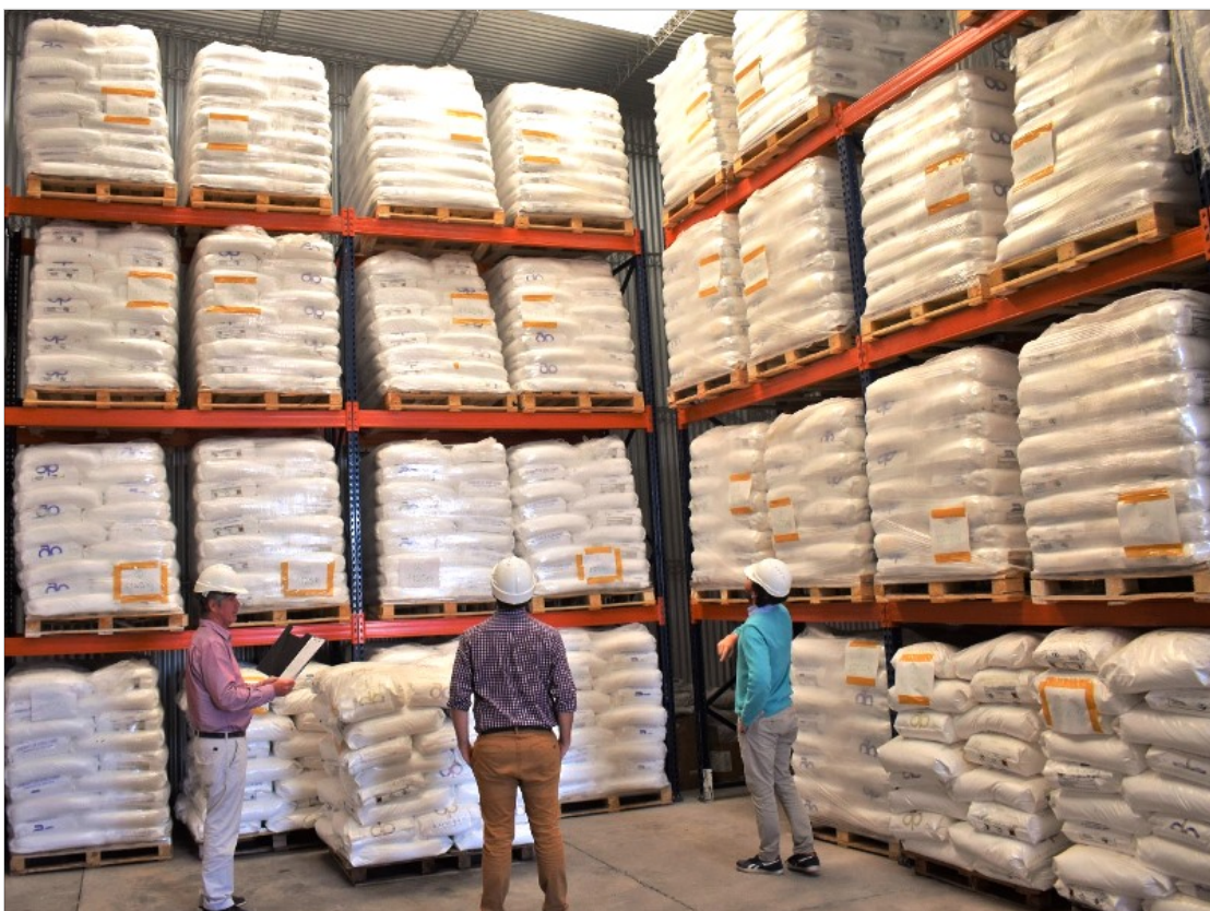
Figure 2. Rincon Lithium Project – Procuring Chemicals for Continuous Pilot Plant Processing Works

The industrial scale pilot plant was first commissioned in April 2018, with first battery grade 99.5% lithium carbonate confirmed in June 2018.