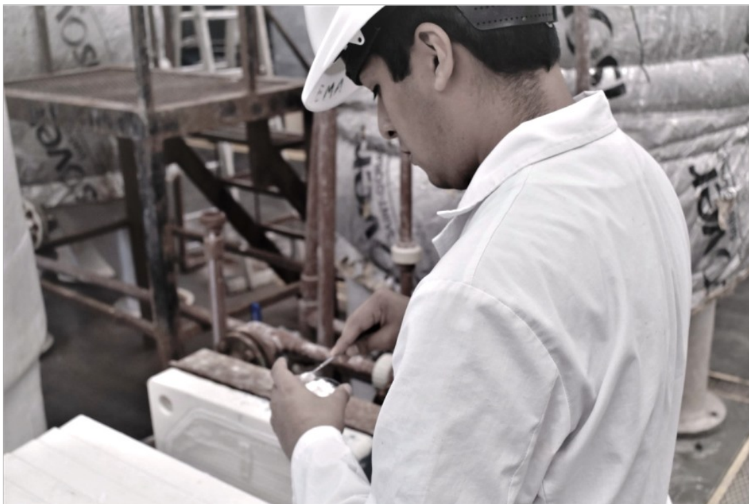
Figure 6. Rincon Lithium Project – Pilot Plant Processing Works

The aim of these strategic engagements is to provide battery quality LCE product samples preferentially customised for the specific requirements of the end-user and confirm the viability of an economic pathway for long-term commercial scale production of LCE product. This will be supported via the independent validation of estimated project capital expenditure items and on-going operational costs.