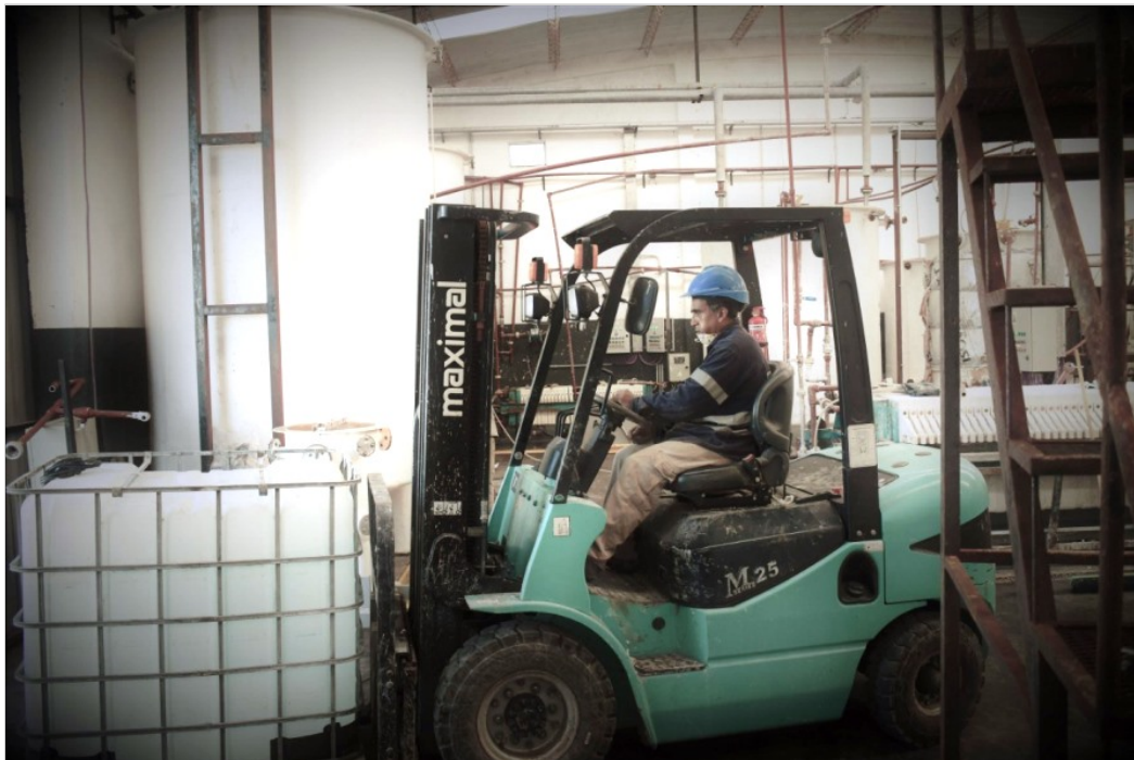
Figure 5. Rincon Lithium Project – Pilot Plant Processing Works

The Company is continuing processing works to prepare the specified customised lithium hydroxide samples for delivery to the Korean battery group.