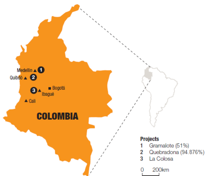
Figure 1: Project Locality plan

The Quebradona project is situated in the Middle Cauca region of Colombia, in the Department of Antioquia, 60km south-west of Medellin (Figure 1).