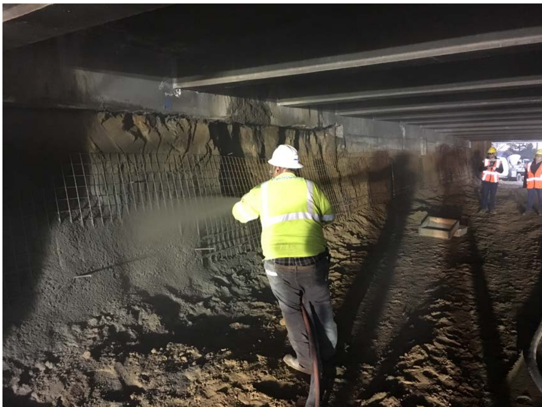
Figure 1. EdenCrete® shotcrete concrete mix being applied

As referred to above, following approval by the Colorado Department of Transportation (“CDOT”) for EdenCrete® to be used in a shotcrete concrete mix, during the quarter EdenCrete® was used for the first time on the CDOT Central 70 project in Denver (see Figure 1).