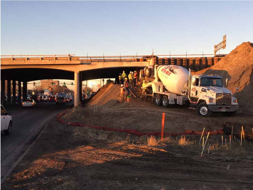
Figure 2. EdenCrete® shotcrete mix being supplied to the CDOT Project

The EdenCrete® shotcrete mix was used to stabilize a buttress wall under an I-70 bridge (see Figure 2), and performed very well. The project is estimated to require 6,000-10,000 cu/yards of shotcrete. EdenCrete® is currently being added at 0.5 gallons/ cu. yard of concrete.