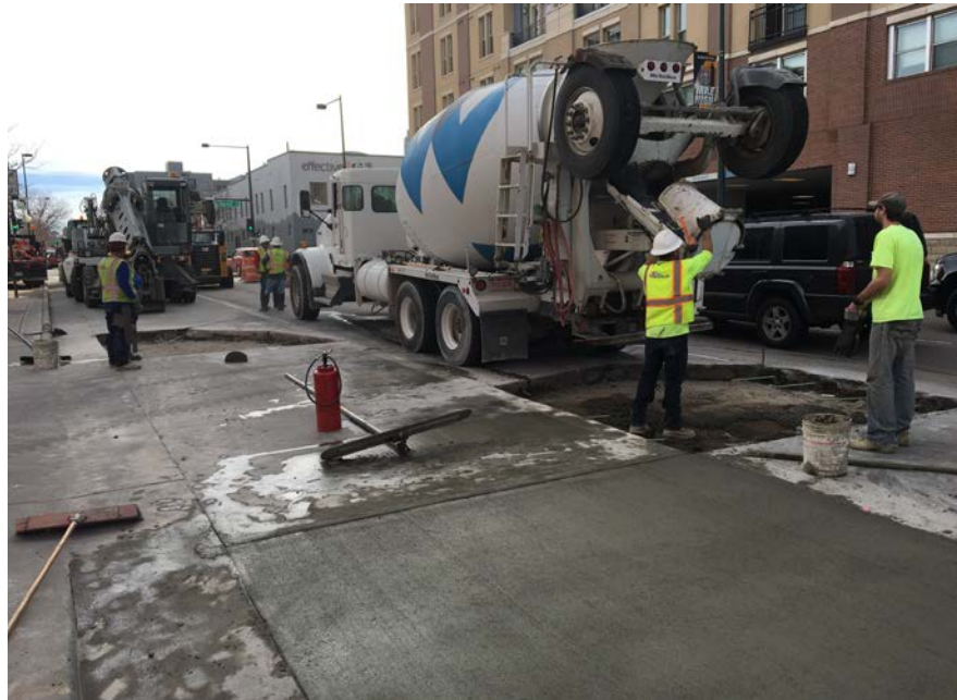
Figure 3. EdenCrete® Trial Slabs in first trials.

The study provides a strong, independent assessment of the significant benefits delivered by EdenCrete® in this field trial. It analysed the comparative performance of a standard concrete mix, and two other similar mixes but with EdenCrete® added at 2 gallons/ cubic yard of concrete and at 3 gallons/ cubic yard of concrete respectively. It measured and compared changes in the three mixes in respect to compressive strength at 7 days and 28 days, as well as slump that was measured at the time of conducting the tests.