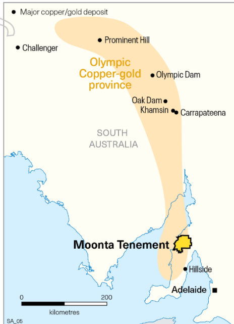
Figure 1: Location of Moonta tenement

EMR is an Australian private company comprising a team of senior mining professionals with extensive experience in mine development and operations, including ISR production in South Australia. EMR is an associated entity to Environmental Copper Recover SA Pty Ltd that is currently advancing the Kapunda Copper ISR Project and comprises the same project development team.