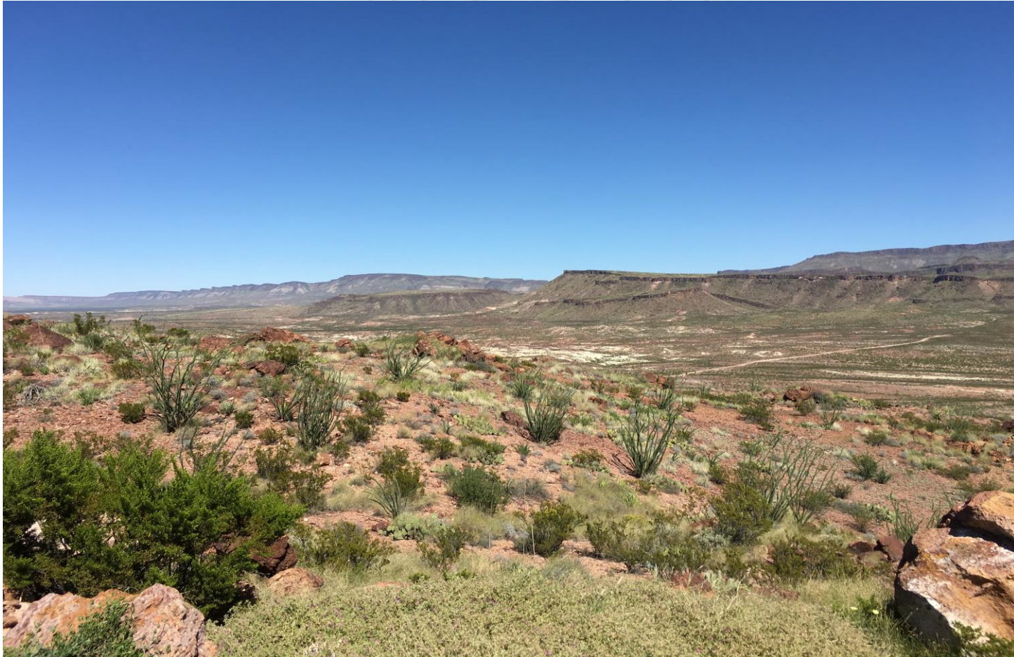
Valley floor runs north-south Picture taken looking north-east