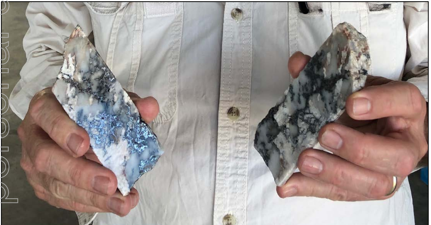
Figure 2: Drill core from hole MO-T23-003D showing strong chalcocite/bornite mineralisation in 0.5m wide quartz vein at 268.1m down hole depth (assays awaited)

"MOD's discovery in March 2016 which is now the T3 Copper Project, followed by recent successes at the A4 and A1 Domes, and now the T23 Dome, suggests the Central Structural Corridor, which links all these occurrences, may represent one of the largest, most under-explored district scale targets for sediment hosted copper."