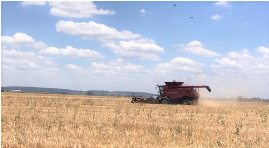
Harvesting barley at Hirschbrooke November 2018

The Board continues to look and examine possible acquisitions for the purposes of a strategic merger with the company.