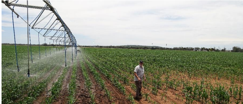
The Chairperson inspecting the irrigator at Hirschbrooke 27 Nov 2018

marketing position and we therefore do not anticipate any substantial change in the wholesale market for vegetables, particularly broccoli in early 2019.