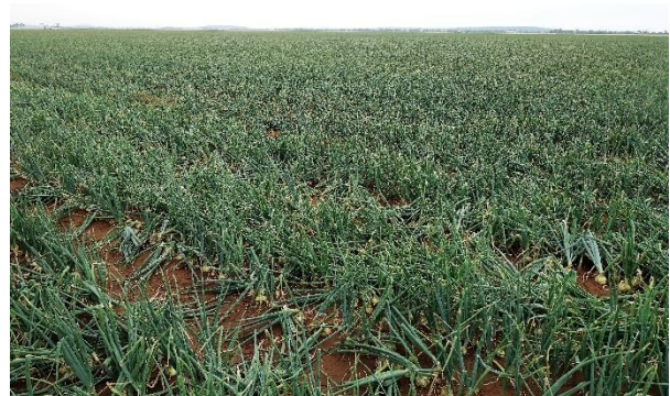
The onion crop ready for harvest in the first week of December 2018

The company will have an onion crop harvested before Christmas, sweet corn in early January and grain sorghum in late January. We can undertake this program because of our water allocation and the efficient and effective irrigation equipment the company has on the farm.