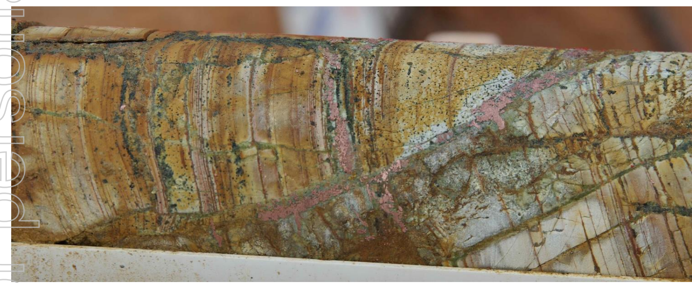
Figure 5: Seams of native copper (copper metal) representing secondary, supergene copper mineralisation hosted by weathered and oxidised bedrock (saprolite).