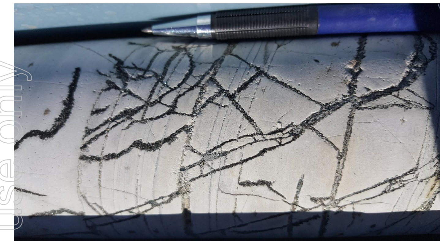
Figure 6: Vein and fracture filling black chalcocite (copper sulphide) representing secondary, supergene copper mineralisation hosted by weathered bedrock (saprock).