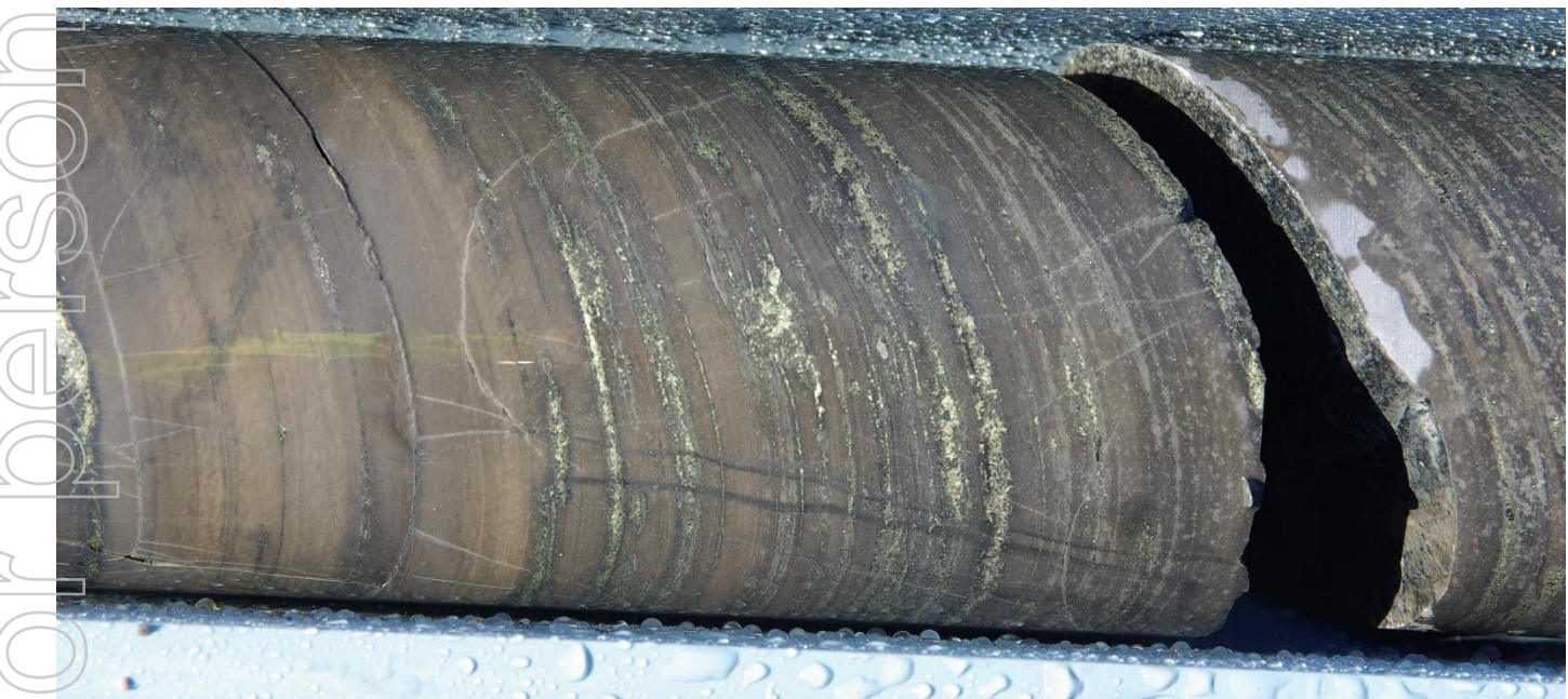
Figure 7: Bedding replacement chalcopyrite (copper sulphide) and pyrite (iron sulphide) mineralisation representing primary sulphide mineralisation in fresh host rock.