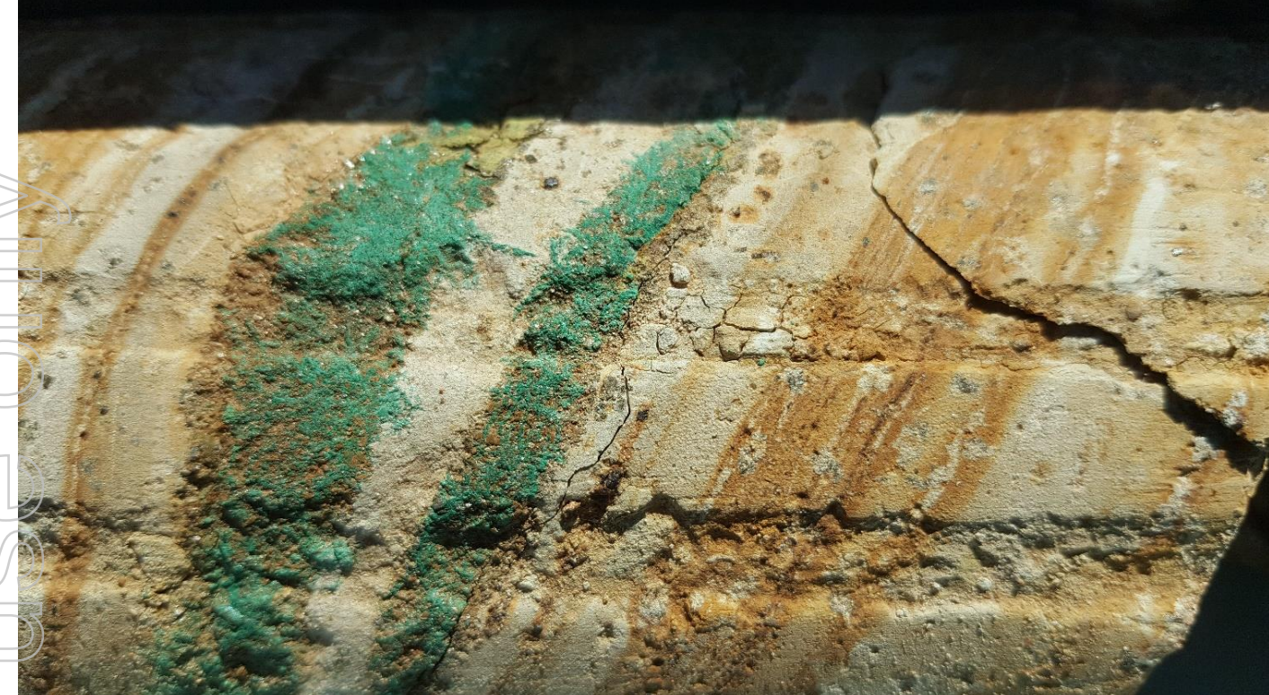
Figure 4: Malachite (copper carbonate) representing secondary, supergene copper mineralisation hosted by weathered and oxidised bedrock (saprolite).