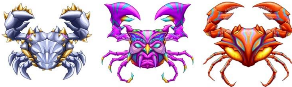
Images 6 – ‘Cryptant Crabs’ from the soon to be release “Cryptant Crabs’ mobile game which is based on the Ethereum Blockchain

Each virtual crab is represented by an ERC721 token, the temper proof nature of the blockchain technology will ensure gamers cannot cheat without adhering to game rules. The blockchain network would also allow tokens transmitted securely between the Company and gamers, as well as between gamers. Based on a ‘Freemium’ business model, the game is free to play, however there are in game purchases and other premium features ranging from US$5 – US$200, which are sold online.