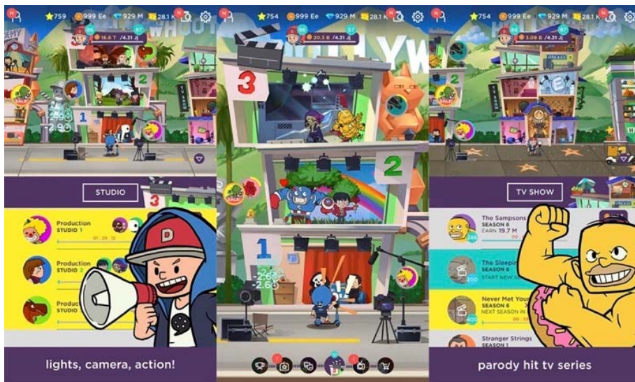
Image 2 – Screenshots from Joyseed's recently developed Hollywhoot Mobile game

Under the agreement, iCandy paid a total consideration AU$250,000 with a conditional AU$100,000 performance sum payable upon milestones. Games will still be developed under Joyseed, however marketing will be managed by iCandy. The Company will also provide resources relating to finance, human resources, game design consultation and server side technology.