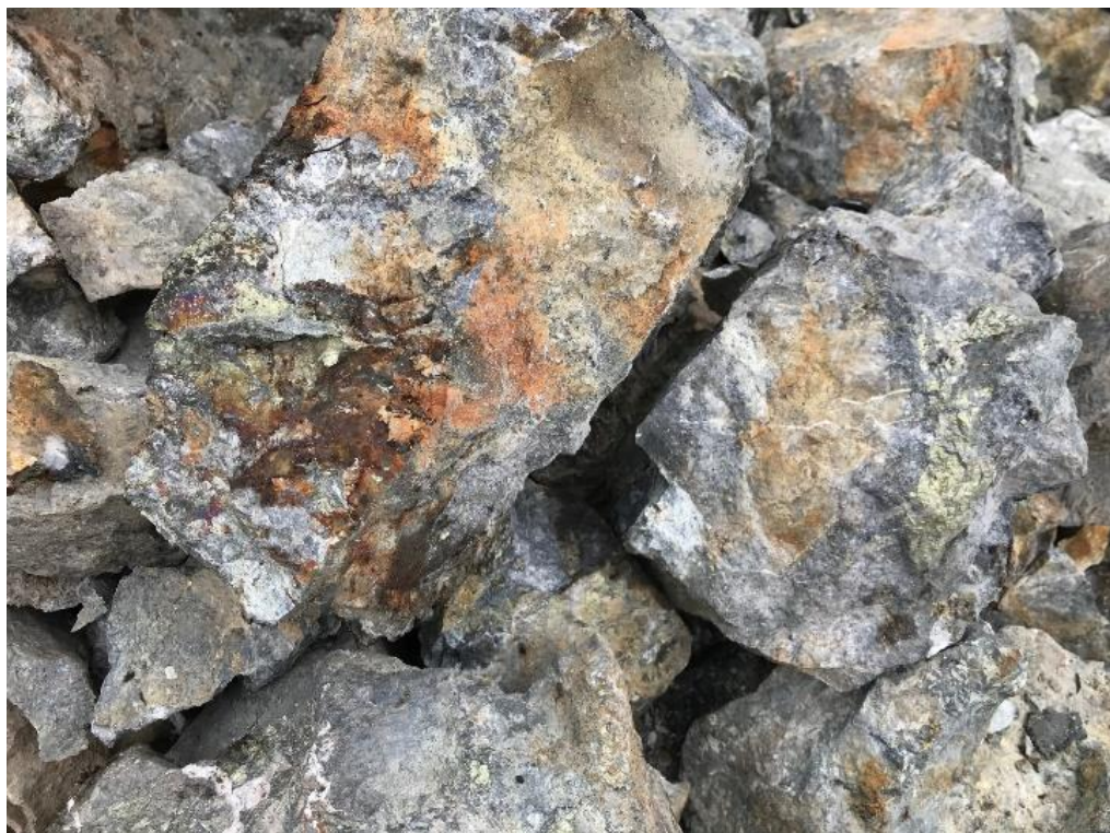
Figure 1: Stockpiled Chalcopyrite-Tetrahedrite-Erythrite (Cu-Sb-Ag-Co) Mineralisation from Joremeny Adit- initial target of underground drilling