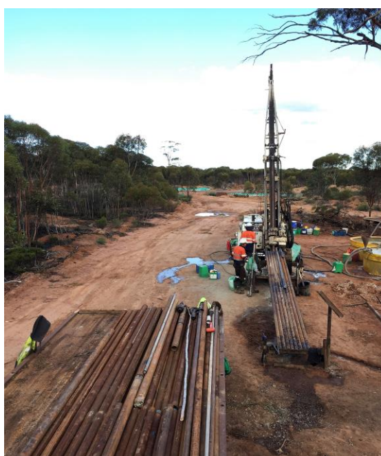
Image 2: Diamond Drilling at Lady Magdalene (Feb 2018)