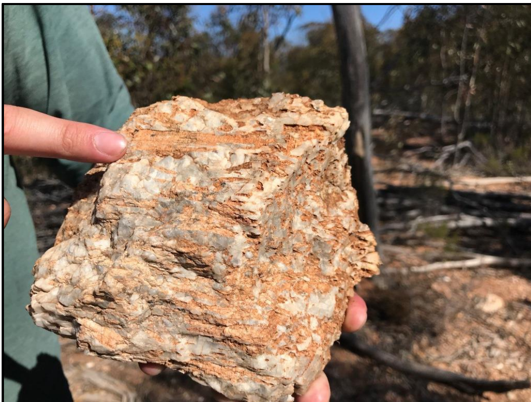
Figure 2: Buldania Project – Photo showing spodumene crystals in pegmatite (Sample ID 202149)