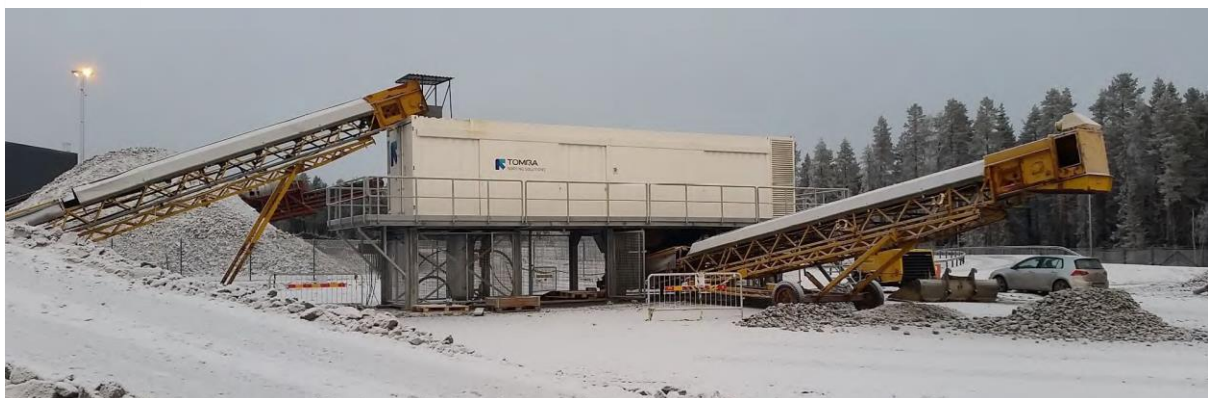
Figure 3: TOMRA Ore Sorter (i2 Mine, Sweden)

TOMRA Sorting Solutions ("TOMRA") have been engaged to perform initial sighter test work on mineralisation sourced from five discrete mineralised waste dumps. The 25kg samples from each of the dumps are to be processed using the COM Tertiary XRT 1200