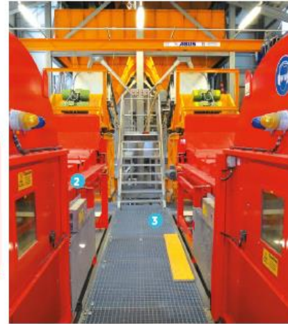
Figure 4: COM Tertiary XRT 1200