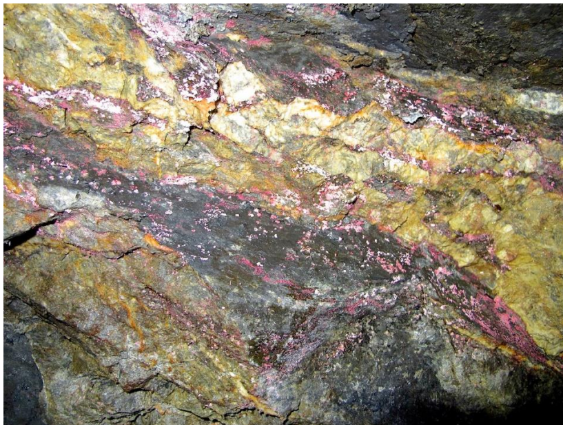
Figure 1: Erythrite-Cobaltite Mineralisation- Joremeny Adit