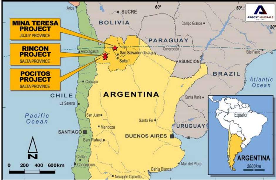
Appendix 1: AGY's Argentina Project Location Map