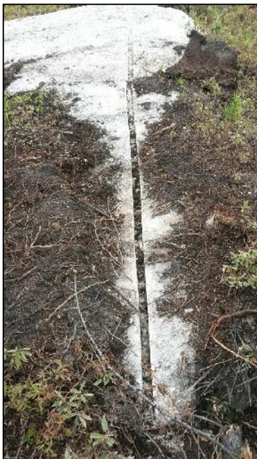
Figure 3. Channel sample across SW Extension spodumene pegmatite.