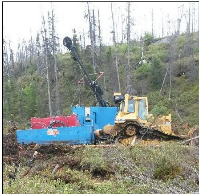
Figure 4. Diamond drill rig and support mobilisation bulldozer at SW Extension, Lemare spodumene project.