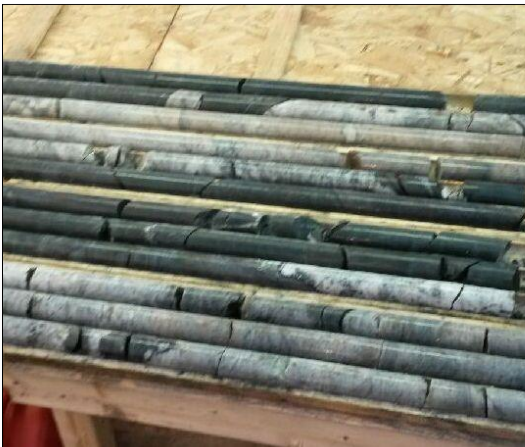
Figure 5. Multiple spodumene pegmatite intercepts at SW extension. NQ core. Preliminary photograph; full details to come, not yet to hand.